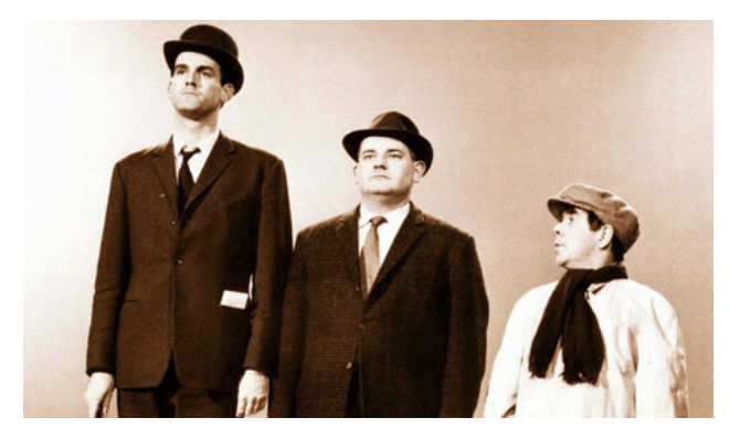
Figure 1 The Frost Report!

and Ronnie Corbett giving a satirical portrayal of the class system during the 1960s. The upper class man looks down on the middle class man, the middle class man looks up to the upper class man but looks