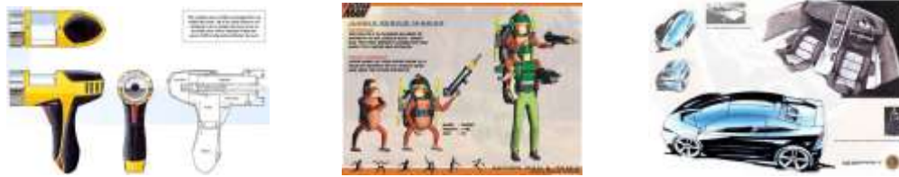
Fig.1 Use of image based CAD by students

In response, two additional pathways, in Product / Transport Design, Industrial Design and later Product/Transport Design with Animation were validated, completing the current suite of courses. From the planning stages of these courses, the need for improved CAD skills was recognised, and three modules in CAD were validated as elements of the degree programmes, designed to equip students with experience of 2D and 3D software.