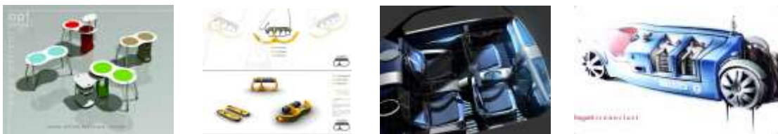
Fig.2 3D CAD works by design students

Recent progress in communication technology allows a high level of remote interaction on product development via the Web. Using this medium, progress can be reviewed, parts inspected, tolerances checked, or even 'fly-through' assessments can be made of complex assemblies. In education, live project briefs can be arranged with companies operating on a global scale, via Internet connections and video conferencing links. This development is particularly significant as it exposes the student to a much wider cultural and industrial experience than can be gained through contacts with largely local or UK based companies. (See Fig.2)