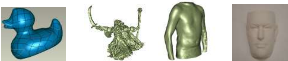
Fig.6 Laser scanning work

Although 3D scanning process is easy and scanning takes very little time, integrating this process for daily use of students proved to be difficult. Problems areas are: learning another software to use only few times a year, individual technical support requirements by technicians and by tutors, resource sharing by different departments, and limitation of scanned objects, (moving, colour, details, thickness etc.) and, necessity to use hardware and software at the University. Laser scanners are beginning to be used by people who would not be considered experts in that type of hardware niche. It is possible that in time, a consumer market for 3D digitising may evolve to be easy enough for designers to use them effortlessly. See Fig.6.