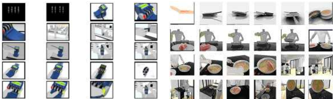
Fig.5 Use of character modelling and animations

Another area needed exploring was to use 3D animation as part of overall design process and presentations. Although Alias Wavefront Design Studio has limited animation features, 3D Studio Max software was chosen due to its easy learning and ease of use. Character Studio, and Reactor software are now part of the same suite and works well with Poser 3D Model software. Recent introduction of these software enabled student to create interaction between their 3D design and moving human and other characters. See Fig.5.