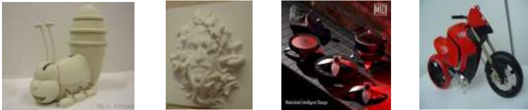
Fig.7 Stereo lithography works

prototyping technology with external companies, recent years two different type stereolithography machines purchased with powder and resin technology. See Fig.7.