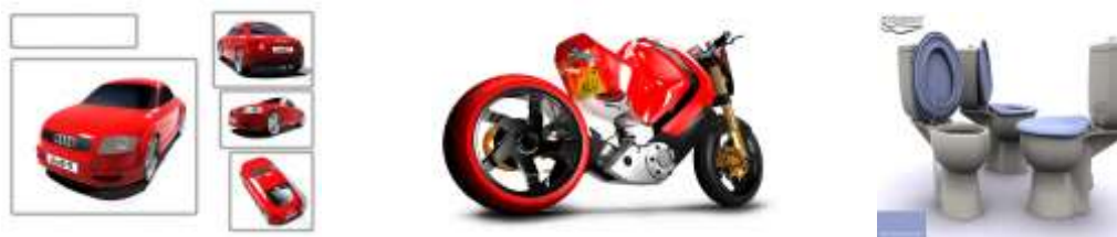
Fig.4 3D Organic shape modelling

Although generally mid range 3D software has been found to be easy to learn and use, it has limitations, for example, modelling a shoe or a car exterior organic shapes are either very difficult or the shape generated is not the one designers wanted. Therefore a surface modeller Alias Wavefront Design studio was implemented, especially for BA Product Design with Animations and BA Transport Design students. Some example of students’ work shown in Fig.4.