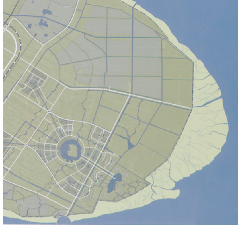
Fig. 1 Aero-picture of Shanghai and its islands (top left). Fig. 2 Master plan of Chenjia Town (top right). Fig. 3-4 Photos of Chong Ming island.