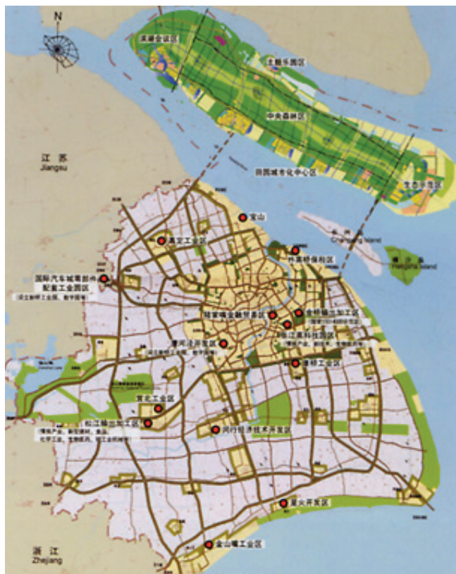
Fig. 5 Masterplan of full Shanghai territory (top).