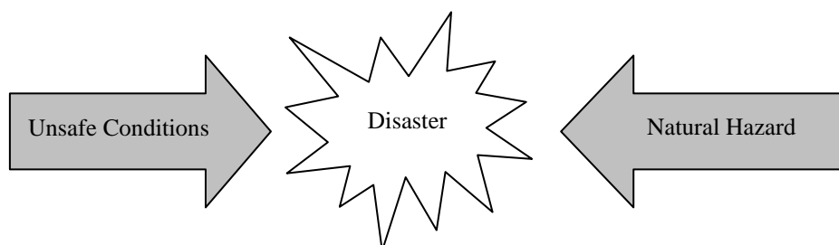
Figure 1.2 Components of a Disaster