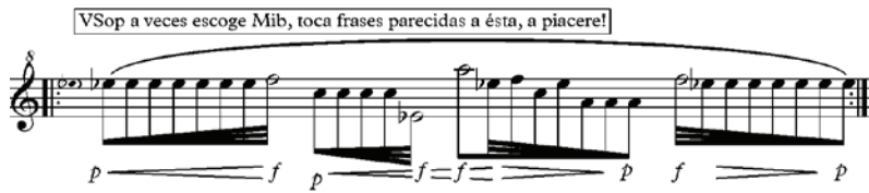
Fig. 3 Example of melodic material to be improvised on during cutscene 1

Given the unpredictability of the narrative detail, although the overall goals are clear, the music has to adapt to accompany the gameplay. For example, on their way to a depot, the player may stop to survey the landscape, and the music must change as they have come to a stop, or the player may fall into a lake, die and re-spawn. The music must provide an accompaniment for each action. This is not an issue if the musicians knew what was going to happen and the exact time, but as it is, they have to adapt to the incidents as they unfold unpredictably. In Terra Nova this was approached by creating musical elements that could be called-up by the conductor of the ensemble immediately, ‘on the fly’ ( see figure 4)