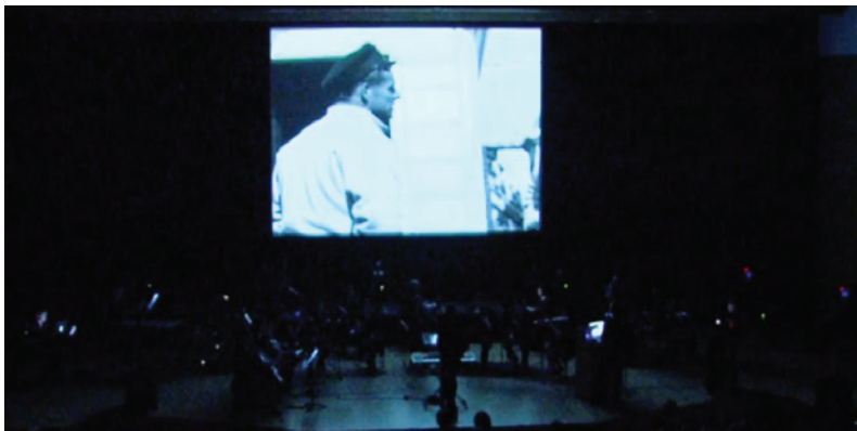
Fig. 2 Performance of Terra Nova at West Road Concert Hall, Cambridge, UK

ate moods, or improvise on, or sometimes these selections were prepared for them especially as cue sheets for specific films (Cooke 2008, Cousins 2011, McDonald 2013). Although this practice all but died out with the advent of sound on film, at various times and to this day, composers and improvising performers have been fascinated by this type of audiovisual performance in which musical instruments give voice to the image. Terra Nova is an attempt to translate this practice to the video game experience, turning it into a performance and adding the uncertainty of the video game narrative.