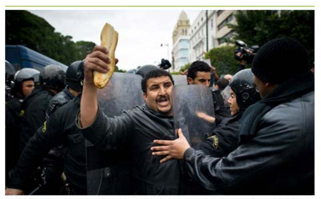
A Tunisian protester holding bread confronts riot policemen during a demonstration in Tunis on January 18, 2011.

Climate cycles linked to civil war, analysis shows