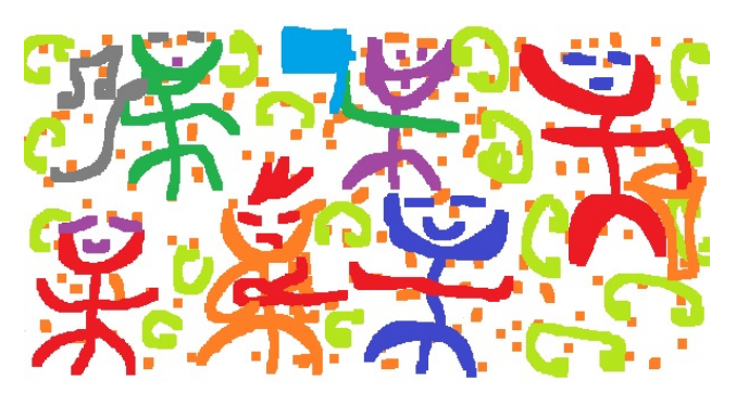
Fig. 5 Pupils' redesigning of Tamazight fonts using digital tools