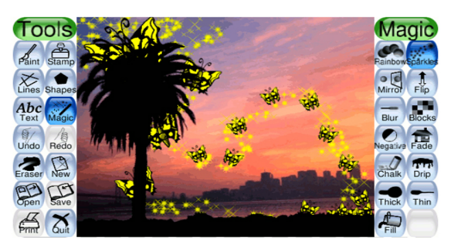
Fig. 3 Tux Paint software used by pupils in the classroom

The research suggested that cultural factors had a strong influence on ethnic and national ways of thinking. This appeared strongly in the choice of subject matter, artistic approach and the final appearance of the work.