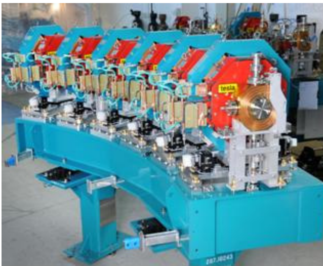
Figure 2: An EMMA girder, with 6 doublet cells mounted. The larger of the magnets is the D and the smaller is the F. RF cavities are mounted in almost every other cell and one can be seen at the end of the girder.

However, to maintain the symmetry of the ring and minimise the effects from resonances, clamp plates are mounted on all the doublets.