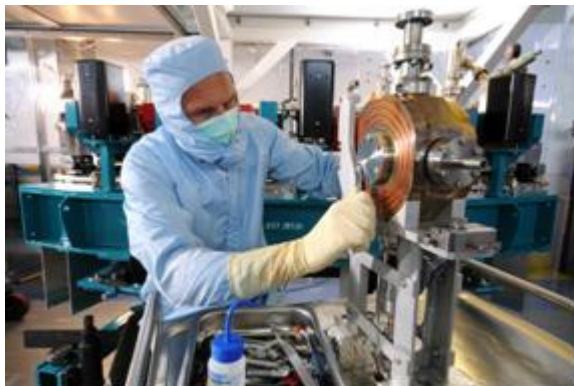
Figure 4: An EMMA RF cavity under test.

The ultimate performance on the accelerator will be the ability of the cavities to efficiently transfer energy to the beam. For EMMA, a normal conducting single cell re-entrant RF cavity design has been optimised for high shunt impedance, working within geometrical constraints of 40 mm beam aperture and 110mm flange to flange length availability. The custom in-house design shown in figure 4 meets the operation specification.