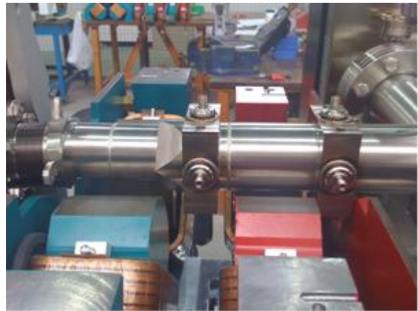
Figure 5: An external view of two 4-button BPMs. The top halves of the neighbouring ring magnets have been removed.

before EMMA, in the ring and destructive devices are mounted in an external diagnostics beam line. The injection line is instrumented with 4 beam position monitors (BPM), 6 motorised YAG screens, including 3 in a tomography section for measuring the beam emittance, a wall current monitor and a Faraday cup, onto which the beam can be directed. In the ring, there will be 2 BPMs per cell (see figure 5), except around the injection and extraction regions, where there is insufficient space for 1 device in each region. There will be 4 motorised YAG screens that can be moved into and out of the ring. These will be driven in from the outside of the ring and will have no support on the inner face. This will make it possible to move the screen so that it sees higher energy orbits, while the lower energy orbits will be undisturbed. There will also be a wall current monitor in the ring.