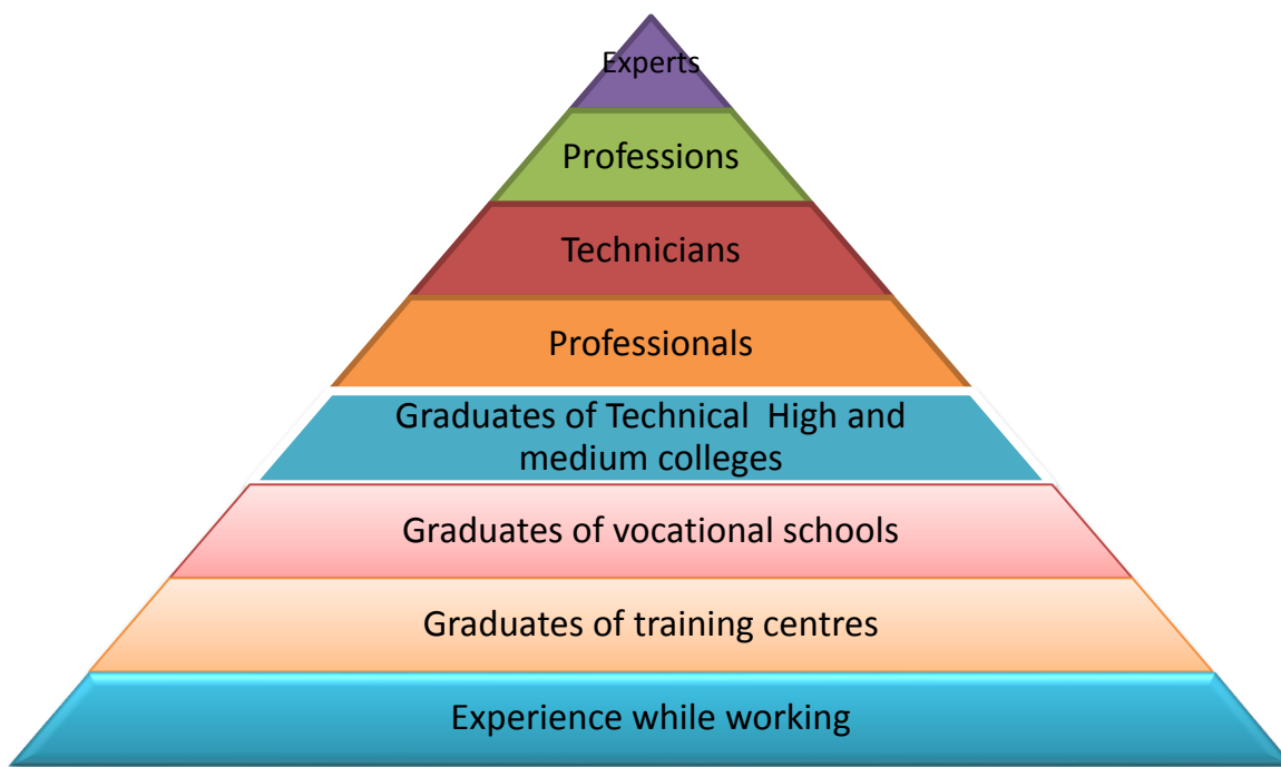
Figure 2: The workforce pyramid in Libya