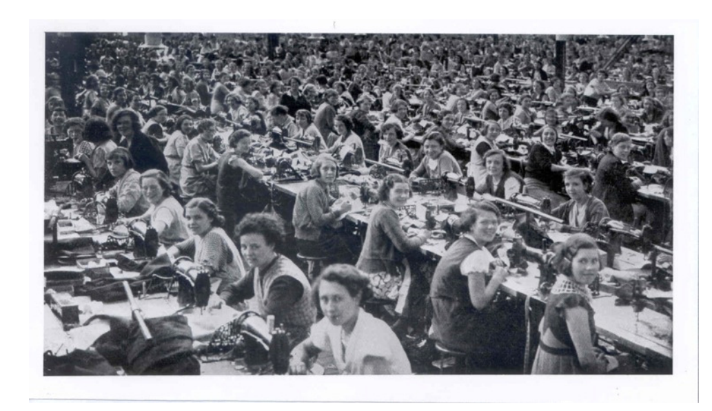
Image 9: Burtons Tailoring Factory, Leeds, West Yorkshire, 1930s.

The fashion department at University of Leeds established 'The Yorkshire Fashion Archive' with an avowed purpose to provide a 'unique historical and cultural record of Yorkshire life' and document 'clothing produced, purchased and worn by Yorkshire folk' in the twentieth century. According to its curators, 'The collection reflects changing social attitudes and multi-cultural influences, economic prosperity, global trends and the regional technical excellence in textiles and clothing over a 100 year period.'39 In 2012 the Archive collaborated with the Woolmark Company and asked University of Leeds fashion students to choose vintage clothing from the collection and rework it to make a contemporary fashion statement, this was exhibited in the Wool Re-Fashioned exhibition from 7 September to 12 November 2012. The garments were produced in donated fabric from Woolmark and formed part of an exhibition at the nineteenth-century industrial mill 'Salts Mill' in Saltaire, West Yorkshire. Each garment was presented next to the vintage garment showcasing old designs and new inspirations. The vintage garments were displayed with captions detailing information about the original Yorkshire-based wearer and their recollections about their purchase and where it was worn, which served to build up a picture of fashionable life within the region from the preceding one hundred years.