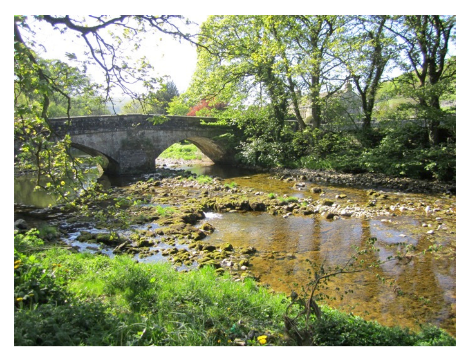
Image 1: Yorkshire Dales, June 2013.

of the famed Yorkshire Dales (Image 1) to the bleaker aspects of the Pennines hill range and the Yorkshire coast. There are combinations of industrial and market towns and five cities in total: Hull, York, Leeds, Bradford and Sheffield, which vary in size. Leeds is the largest city and is the main regional shopping centre for Yorkshire and the approximately 3.2 million people who live there. There are roughly 1,000 retail outlets in Leeds with the most upmarket shopping area being the Victoria Quarter, which houses many designer stores. The Victoria Quarter is also a stylish venue for fashion oriented exhibitions such as the annual British Wool Week , an exhibition organized by the Campaign for Wool . The cities of Bradford and Sheffield have an industrial heritage for textiles and steel, respectively. Hull is predominantly a fishing port and York, originally founded by the Romans, offers a multitude of historic attractions. York Minster, the most famous, is the largest gothic cathedral in Northern Europe.