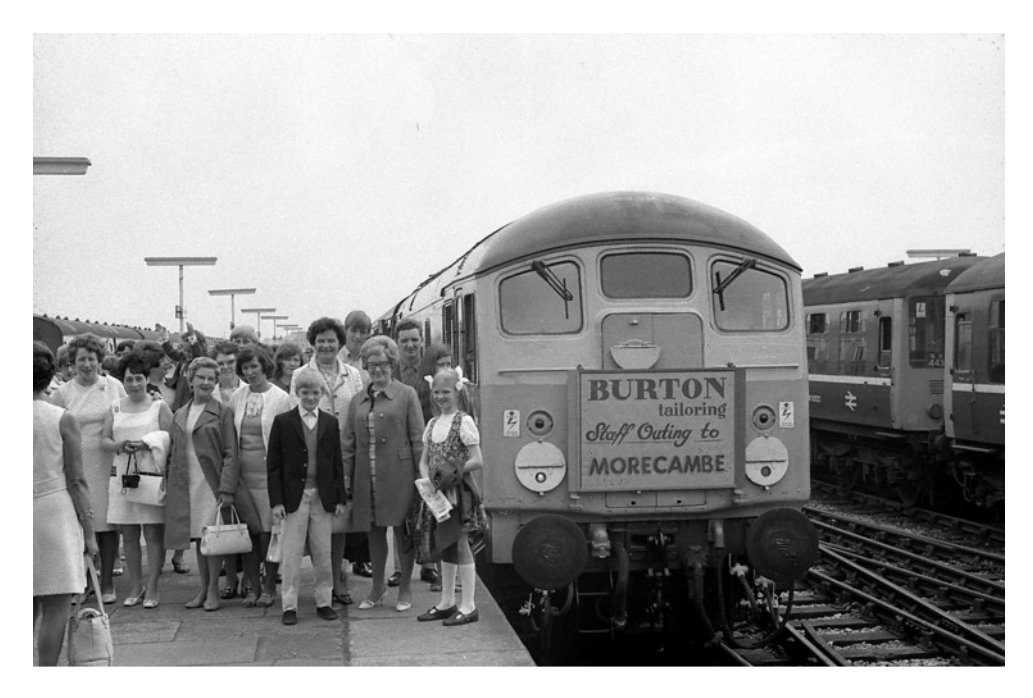
Image 3: Burtons staff day out to Morecambe, Lancashire, 1960s.

I also examined literature that focused upon fashion marketing, promotion and branding, discussing both the theory and practice of marketing in the fashion industry. I wanted to develop my understanding of brands and how they are communicated, launched and evaluated. This approach helped me compare ideas discussed with interviewees about the marketing of Yorkshire fashion as a branded label and the process of communicating the value of the product to a potential customer base. Linking these to theories about the creative economy and the aesthetic marketplace helped to contextualize ways in which Yorkshire fashion could be identified as a source of economic revitalization, exploited on a more global basis. These ideas have been particularly explored by Florida, who emphasises how investment in culture and technology are key ingredients to attracting and maintaining a local creative class which links directly to the economy. As Florida has observed, the creative industries have become increasingly important to economic well-being, which suggests that 'Human creativity is the ultimate economic resource.' <sup>15</sup>