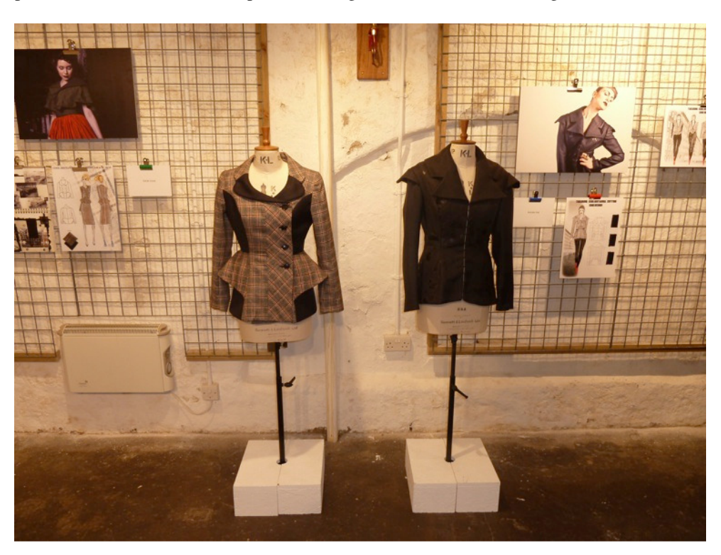
Image 8 : Armley Mills tailoring exhibition, Leeds, West Yorkshire, June 2012.