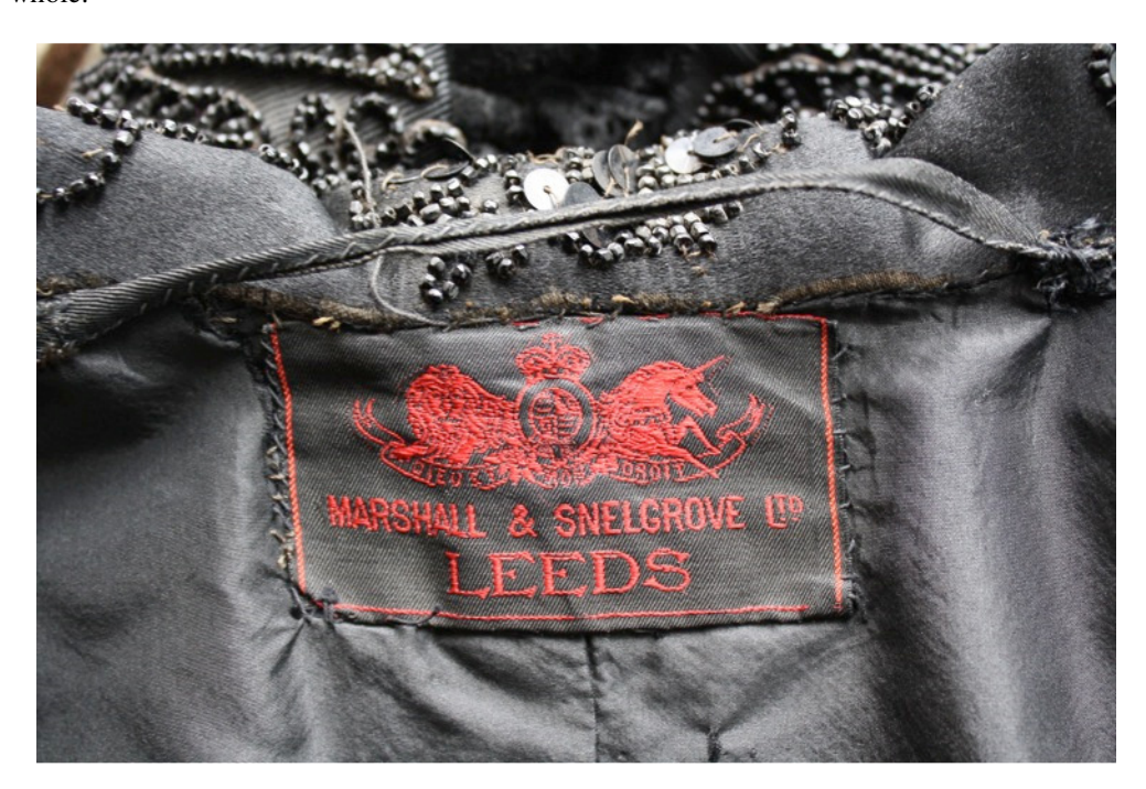
Image 5: Marshall and Snelgrove garment label, circa 1930s.

My research revealed other similar initiatives within Yorkshire. I attended a meeting of the Leeds Fashion Design and Manufacturing Hub (LFDMH) at the Melbourne Street Studios in Leeds in September 2012. In an email sent to me on 29 August 2012, members at the Hub revealed that the initiative had worked with the Business Support Team of Leeds City Council to deliver a vision for a centre of fashion design and manufacture. It was supported by an 'Active promotional programme and a wider network of facilities, including prime retail locations and high profile gallery and event space.' To make this vision a reality the initiative had decided to look for designers, manufacturers and machinists to participate in the development of the Leeds Fashion Design and Manufacturing Hub to be based at Melbourne Street Studios. The initial discussion focused upon a 'Made in Leeds' concept. In the talks, however, I was able to emphasize the wider initiatives in Yorkshire that are developing an inclusive Yorkshire fashion brand. I observed that focusing solely on Leeds was perhaps too narrow a vision and excluded the fashion design and manufacturing potential of the region as a whole.