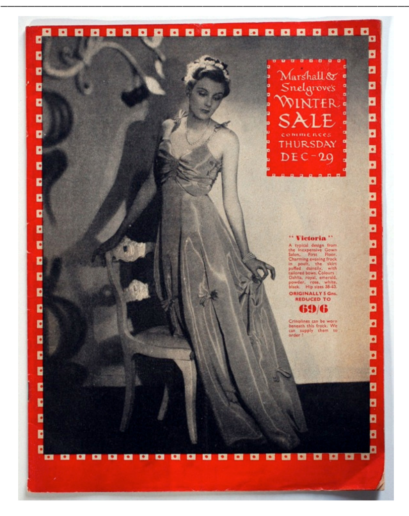
Image 6: Marshall and Snelgrove, Leeds, West Yorkshire, circa 1930s.

Reflections from members of the Costume and Textile Society gave a picture of retailers and dressmakers, social events and shopping occasions both attended and 'dressed up' for in Yorkshire. They also captured how fashion was appropriated, understood and promulgated within the region. Since the average age of the Society members was over sixty years of age, it was possible to gather data recording family memories stretching back throughout the twentieth century. One respondent reminisced about shopping in Leeds.