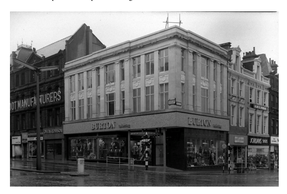
Image 4: Burtons shop, Leeds, West Yorkshire, 1960s.