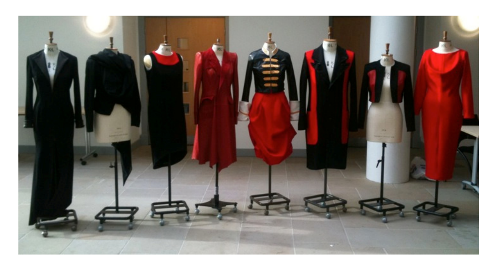
Image 7: Graduate outfits from University of Huddersfield fashion students, made in Hainsworth cloth, Behind the Seams, Armley Mills, Leeds, West Yorkshire, 2012.

So many of Yorkshire's economic roots can be linked to textiles; however, there is a common misconception that the industry has disappeared. The reality is that the mills have shifted from mass production to high-end niche markets and are producing some of the finest cloth in the world.<sup>37</sup>