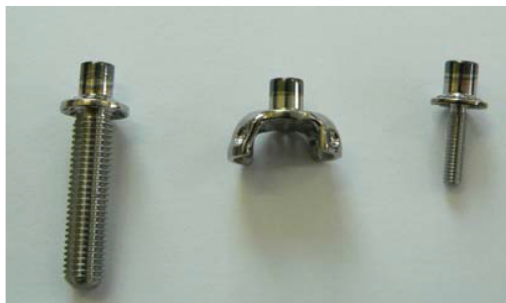
Top: Diamond-like carbon (DLC) coated aluminium based instrument used during gall-bladder removal. Below: Partially DLC coated osteotomy screws.

Urinary catheterisation is a common procedure for both short- and long-term use. Coating catheters with DLC reduces friction, both on insertion and in use, reducing local tissue damage and improving patient comfort. The catheter is an effective bacterial