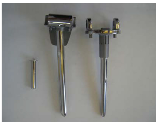
Titanium-alloy total knee prosthesis, coated (above) and uncoated (Below). Images courtesy of Diameter Ltd, Stanmore Implants Worldwide, RNOH

Potentially more of a hazard is that a patient may be sensitive to a metal in a medical implant, such as an orthopaedic or cardiovascular device. Orthopaedic prostheses such as hips, knees and shoulders are comprised of a substantial amount of metal with a large surface area exposed to surrounding hard and soft tissue. Any sensitivity is often detected prior to an operation by giving patients a metal allergy test to circumvent an untoward response to the implant. Diamond-like carbon has been successfully applied to a number of implanted devices, including total knee prostheses for people sensitive to constituents of a titanium alloy.