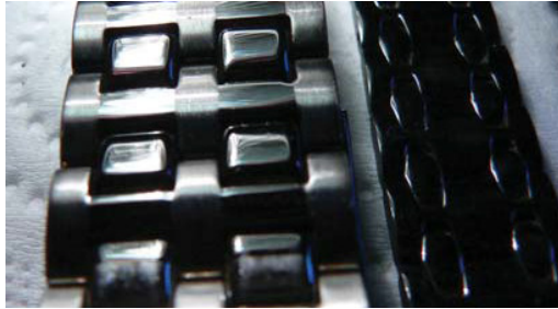
DLC coated watch straps.

Further processing techniques, such as fluorine incorporation during deposition, or post-deposition oxygen plasma treatment, can control surface hydrophobicity of the coating – a property that affects biocompatibility and fluid flow in medical devices, as well as water resistance of watches.