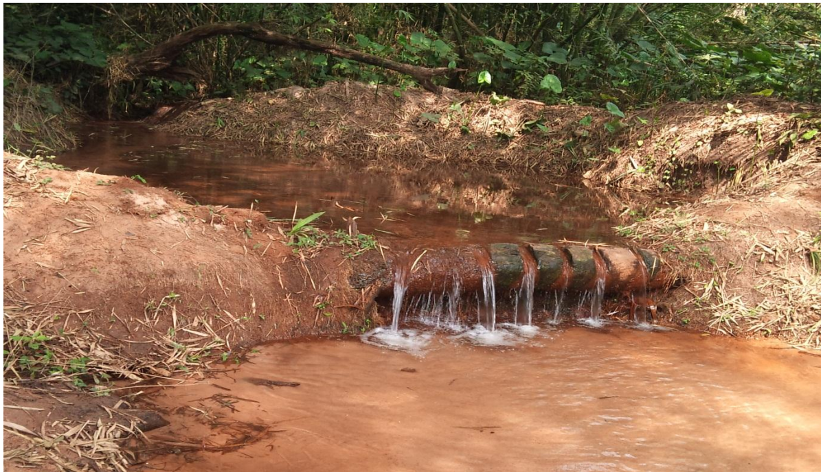
Fig 1: Ezeani Stream-Water

Ezeani is believed to possess some supernatural powers. There is a shrine situated a few yards away from the stream-water, which is called Ezeani shrine. The shrine usually has a traditional priest who attends to it. From the researcher's inquiry, every first female child born by any women who hail from Ifite Village must be dedicated to the Ezeani shrine via the Ezeani traditional priest. The first males children were meant to be dedicated elsewhere. The failure to do so is believed to result to medical, mental or physical impairment of the child, including death at some point in life.