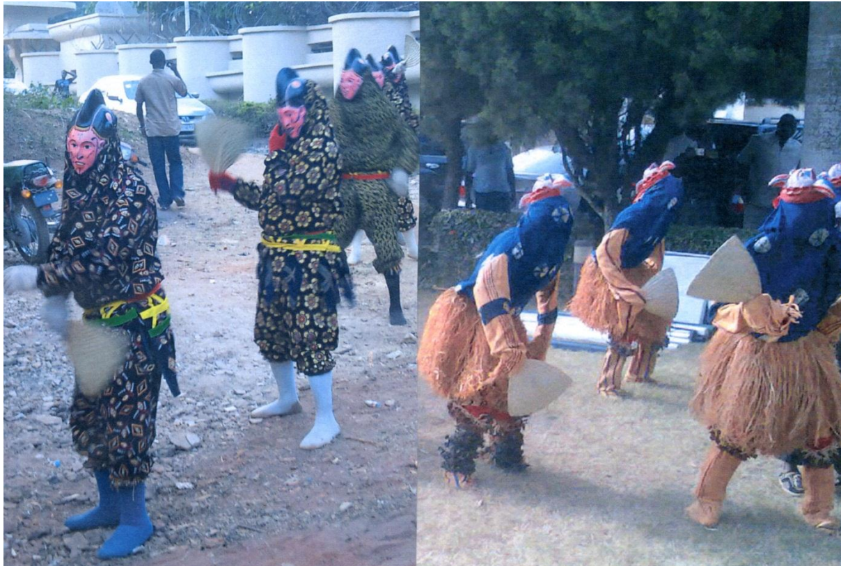
Fig 4: Masquerades

The two types of masquerades depicted here are purely the entertainment types which are usually trained to dance during certain ceremonies when they are invited. This is not to say that the people do not suspect them of possessing magical powers. There are other types; some of them may appear scary, and can be troublesome. The researcher was unable to take the photographs of the scary and troublesome ones for ethical reasons. When the researcher interviewed ‘Ugonna’ (the person he believed to have good knowledge of masquerades) to find out why the community members link what they believe to be mental illness to masquerading, the following response was obtained: