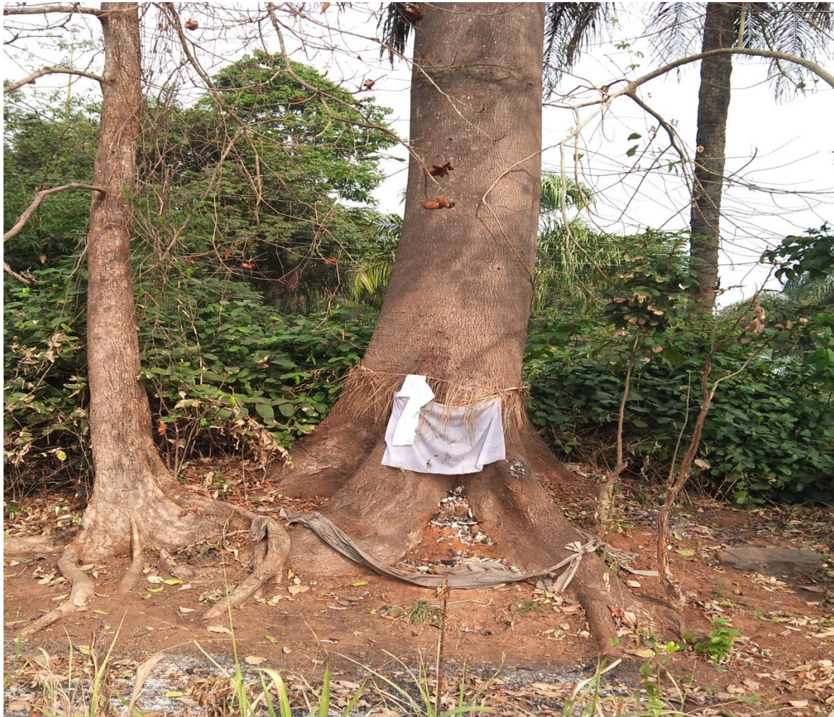
Fig 2: A Tree Totem