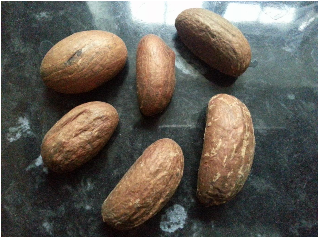
Fig 3: Bitter-cola (Ugolo)