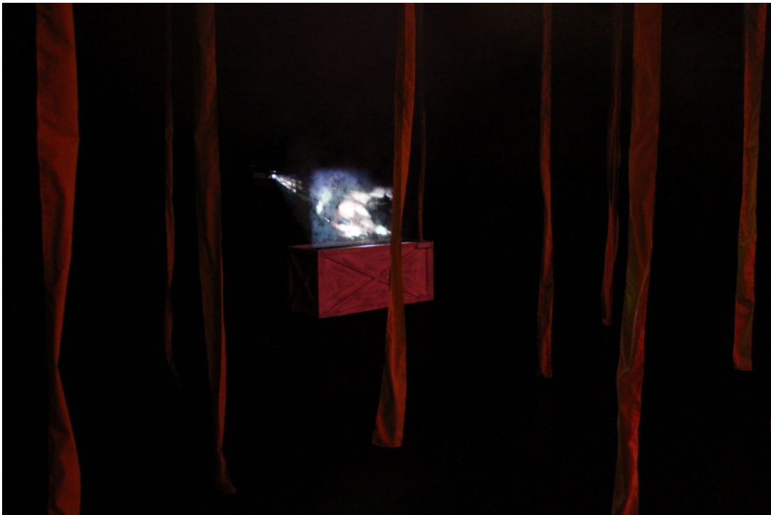
(Figure Six: Smoke Projection in Reverie , 2012)

functional for a viewer to go up and physically engage with the unit and to interact with the images on the smoke, as the movement of a person would disrupt the airflow around the unit, making the footage unclear to the observer for some time. For the final installation/demonstration the unit, as seen in figure six below, had the fans turned on to enable the audience viewing the kinetic smoke screen the chance to visually, as well as physically, engage with this projection viewing technique.