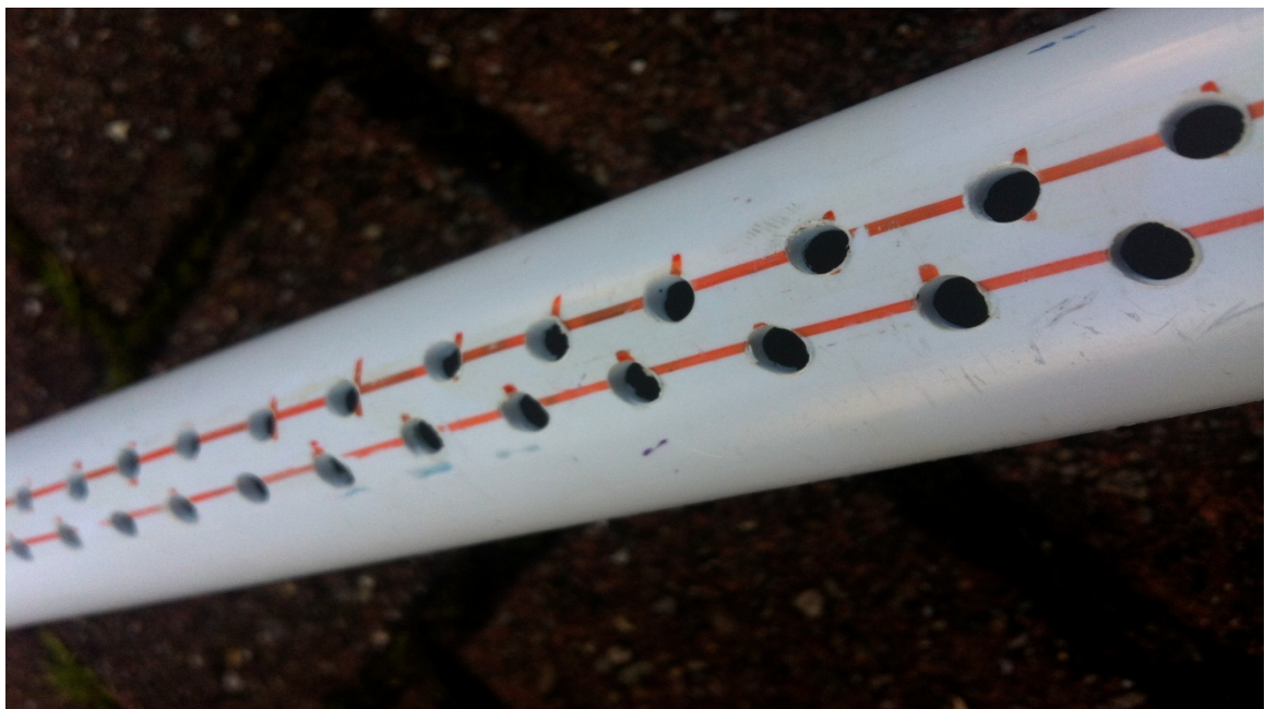
(Figure four: PVC tube used to dispense the water for Reverie, 2012)