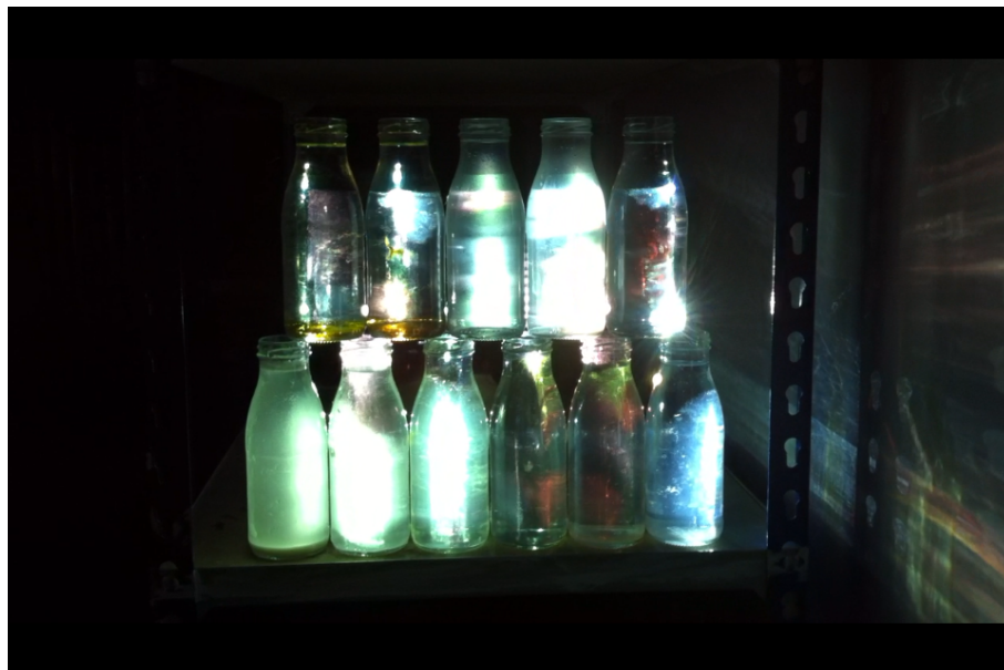
(Figure Two: Glass bottles. Some of which are frosted and other with varying concentrations of diffused water.)

Having undergone initial experimentation in viewing projected content on sand, I also carried out a number of tests within the workshop into the application of viewing projected content onto/through water; in this circumstance a number of glass bottles containing water were used: The aim of this was to develop first-hand experience into the effect that water had on the image. During this examination different methods of diffusing the image were experimented with, in an attempt to make the footage on/through the bottles become more visible to the observer. A variety of techniques were implemented such as spraying the outside of the bottles with a frost spray and mixing a number of substances: flour, syrup, gelatin and others into the water to produce an alteration in water density, as seen in figure two below. Through adding these substances to the water, the bottles became in a sense easier to observe, due to the light being diffused; this made the footage in the water hard to fully perceive. The best result from this examination came from the application of a frost spray, on the back half of the bottles. When projecting content onto these frosted bottles the image was diffused, preventing any intense light from blinding the viewer when watching the content shown on the bottles, but still allowing the image to clearly pass through the frosted glass and water, creating a captivating effect.