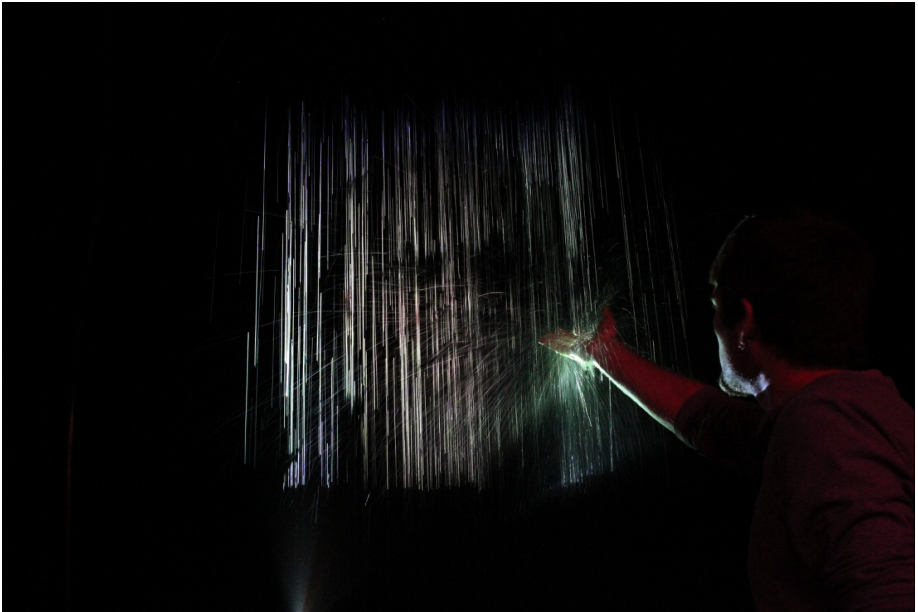
(Figure five: Image of water screen in Reverie , 2012)

Once I had developed these variables and applied them through trial and error, the water screen was at a point in its development where it could undergo the final stage of construction. This would be the unit later installed and then used within the demonstration; figure five below shows an image on the water screen used in Reverie (2012).