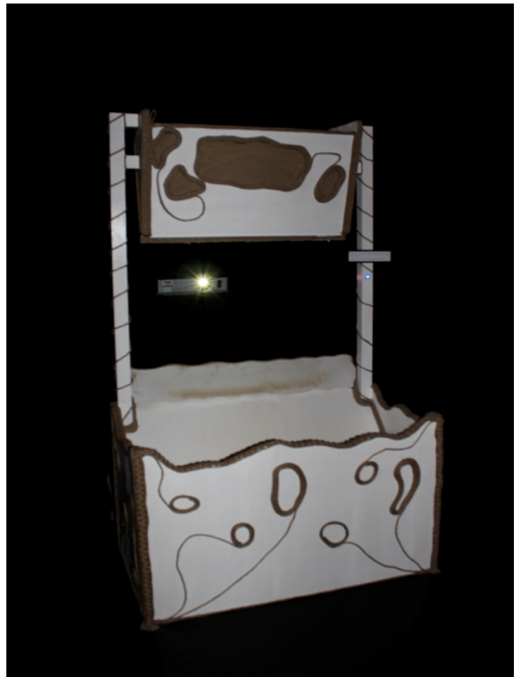
(Figure three: Sand projection viewing Unit used in Reverie , 2012)

After reading the conceptualisation for Perfect Time (2004), the concept of the audience having to feed the unit sand so that they could in turn view the content being projected, was an important element to create physical engagement. Whereas in Perfect Time (2004), the audience would not see any content until physical interaction had been made by the audience through adding sand to the units, in Reverie (2012) this was not the case. The final unit, figure three , as shown on the right, was designed and then built so that it was pre-set with enough sand to allow the viewer approximately 1 minute 30 seconds to view the content.