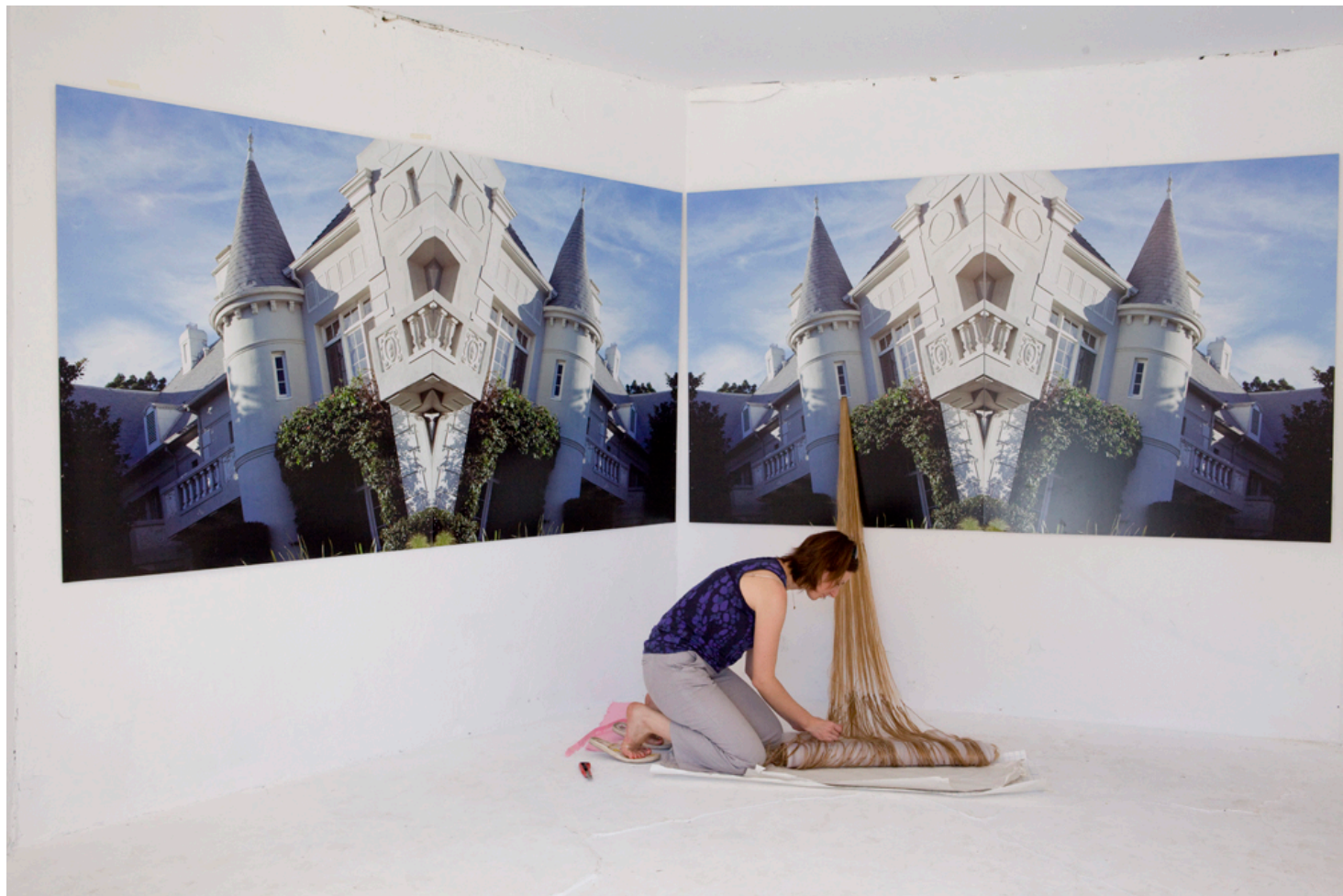
Let down your hair, (2009-10) Installing, 2010