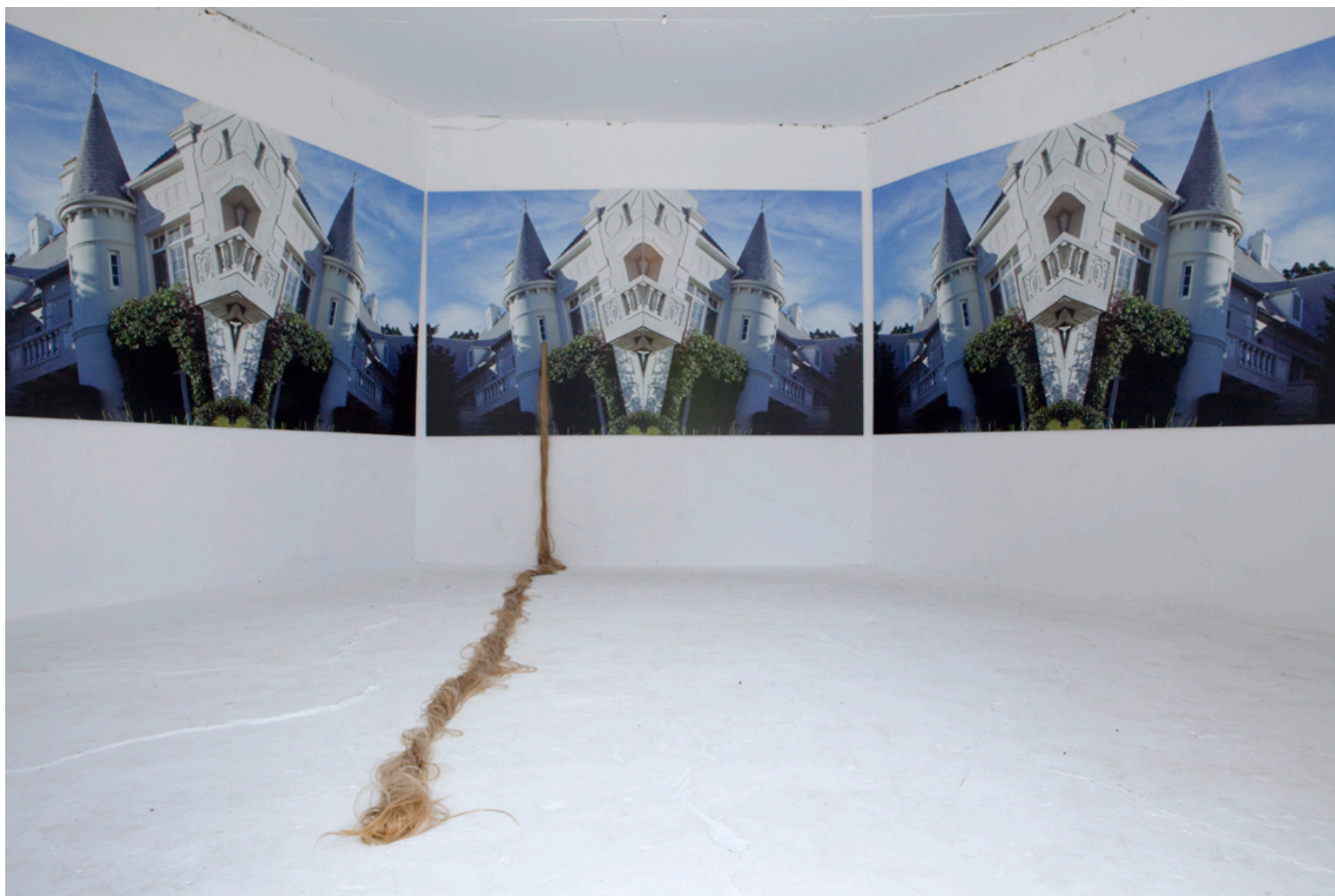
Let down your hair, (2009-10) Photographic installation, Lambda digital prints, 125 x 125 cm diptych , 530 cm synthetic hair extensions Kodra 2010