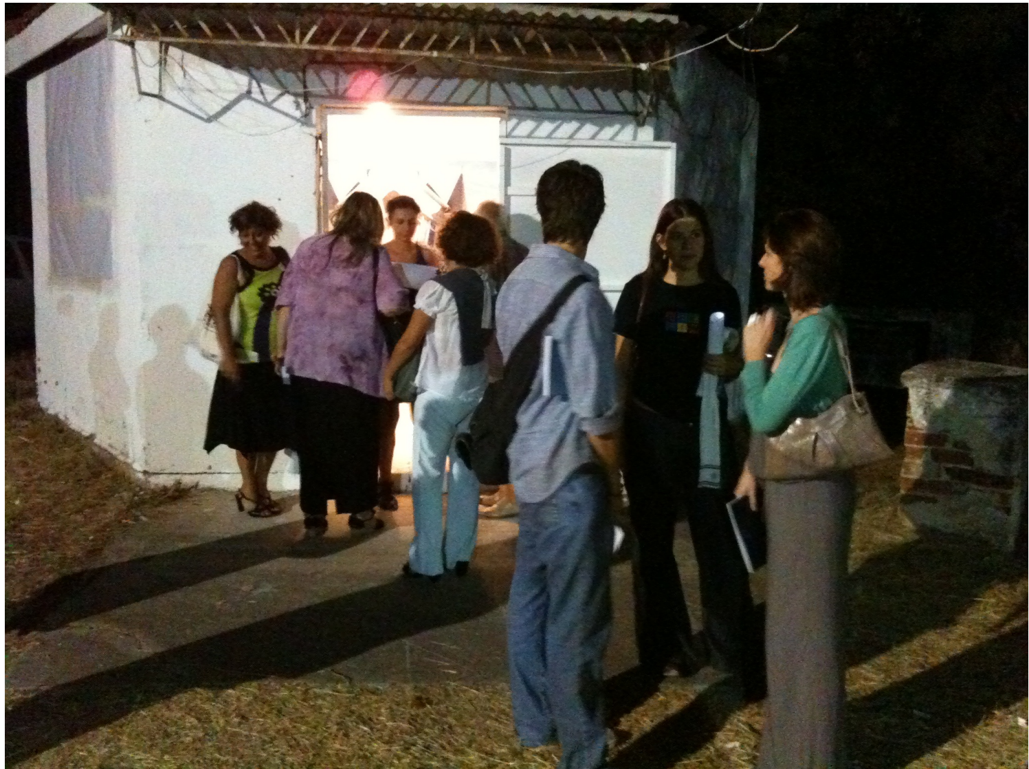
Let down your hair, (2009-10) Opening night, visual arts festival, Kodra 2010