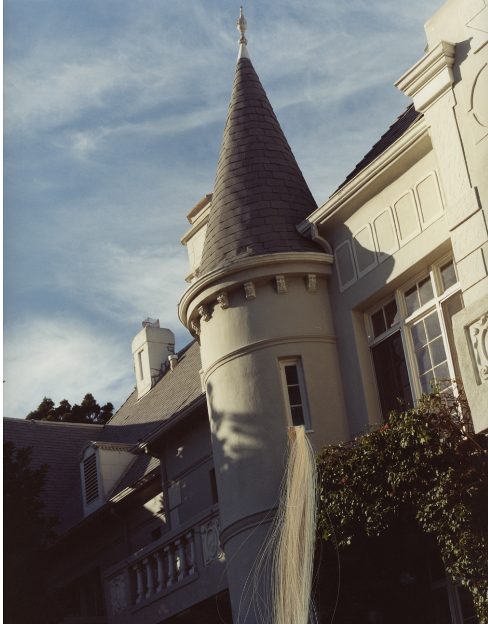
Let down your hair, (2009) C-type & synthetic hair extensions, test, 28.5 x 31 cm