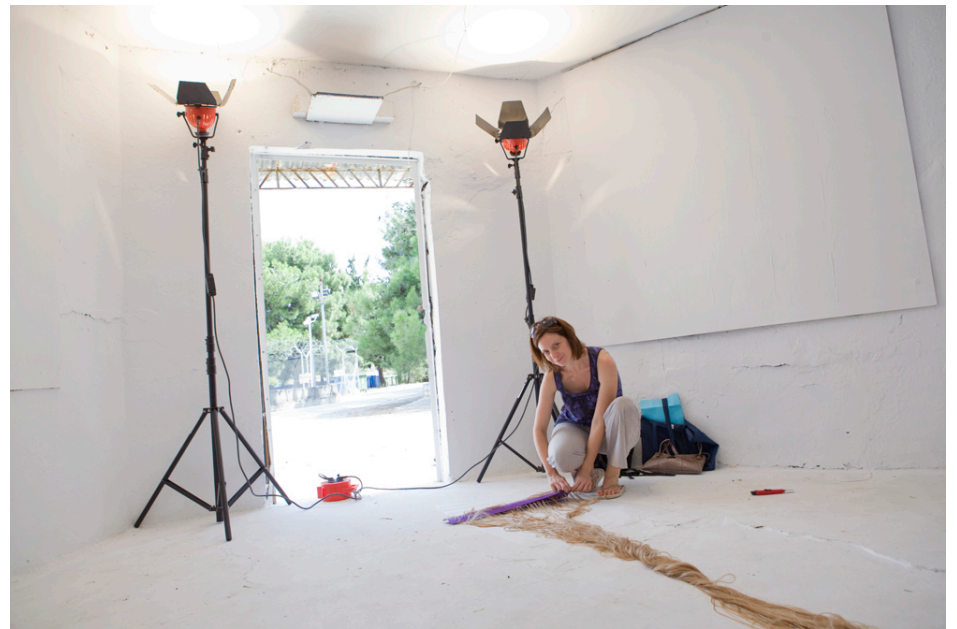
Let down your hair, (2009-10) Installing, 2010