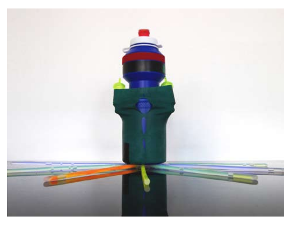
*Image 2 Sandettie Lightship (2012) Photograph of sculpture utilising appropriated objects and referencing a weather station positioned in the English Channel that swimmers use to predict the weather for a swim

swims the channel as performance is starting from a different perspective. The 'happening' of the channel swim takes place in an unpredictable environment continually in a state of flux, with unexpected, unscripted events unfolding. There is also a lack of an apparent audience aside from the crew and pilot, who are themselves subjects within the performance. Each crew member has a pre-stated (by the swimmer) set of tasks to undertake at specific times during the swim, such as organising hourly feeds and observing the number of swimming strokes per hour<sup>5</sup>.