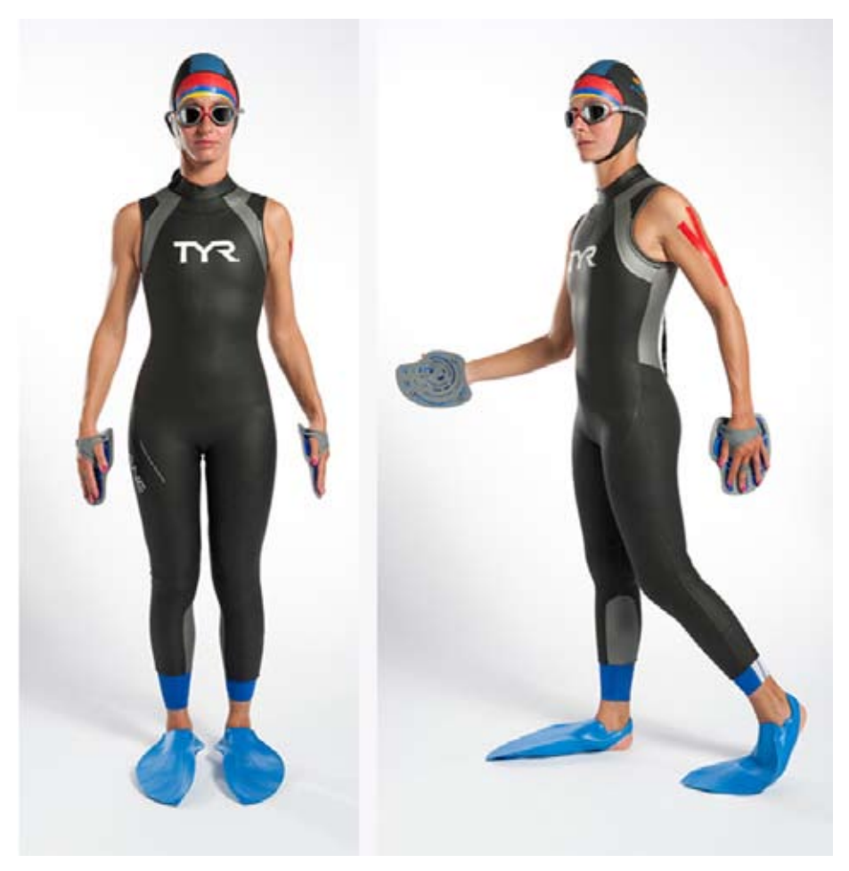
Image 6 Channel Swimwear Rules (2012) Photographs with swimmer wearing banned Channel-swimming equipment