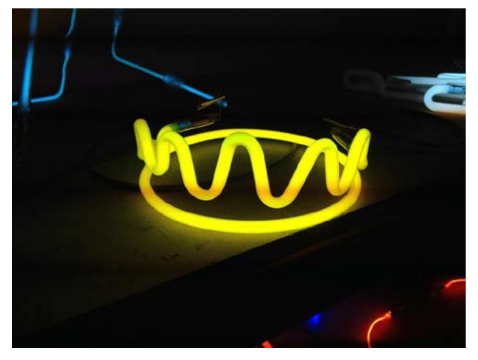
Image 1 The King of The Channel (2012) Yellow Neon Glass Sculpture

Developing into a channel swimmer is a matter of training the body, learning the behaviour, rituals, language and becoming part of the channel swimming community. This communal experience manifests itself clearly in the training at Dover harbour beach, where Channel swimmers have the option of training from May to September each year, swimming in the sea at this location. A group of volunteers run training every weekend, giving advice on timings/planning, feeding and the swim itself. At this training there is a strong sense of a channel swimming community. Here feats of swimming endurance are undertaken, personal limits pushed, camaraderie developed and successful swimmers congratulated. The training is overseen by The Channel General, Freda Streeter, who has trained channel swimmers for over 20 years. She is the mother of Alison Streeter, known as 'Queen of the Channel' because she has swum the English Channel a total of 43 times. Next to this Queen on the thrones of channel swimming is Kevin Murphy, 'The King of The Channel', who has crossed it a total of 34 times (see related art work in Image 1).