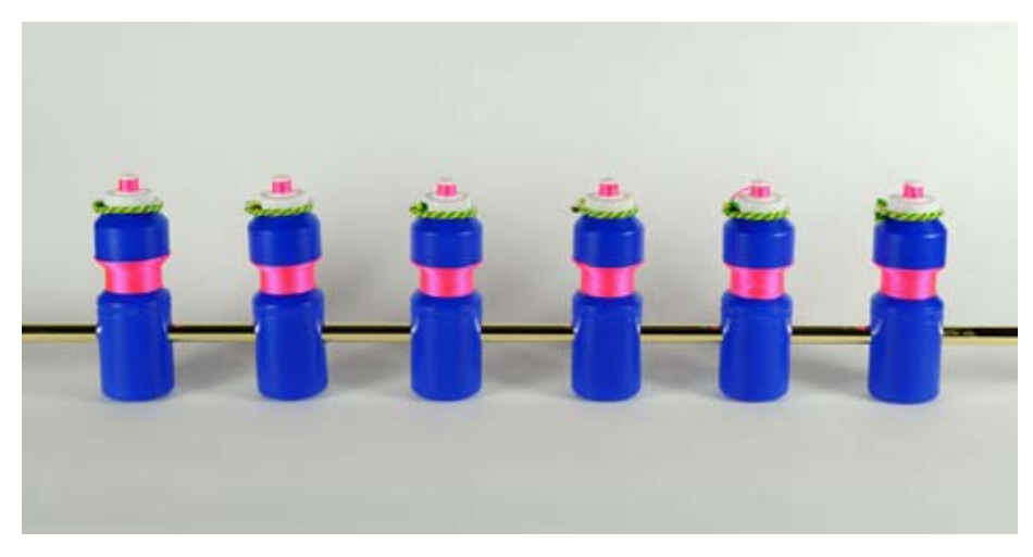
Image 5 Standard Relay (2012) Sculpture based on swimmer's homemade feeding apparatus

on a sculptural presence and become symbolic during the swim; the appearance of these objects during a swim also marks the passing of time as well as the only points when there is a bridging between the swimmer and boat.