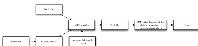
Figure 2. Flowchart for corpus-based transcription.

Rather than using the synthesized audio output directly, CataRT ’s analysis and selection algorithms can be used as a tool for computer-assisted composition. In this case, a corpus of audio files is chosen corresponding to samples of a desired instrumentation. The CataRT selection algorithm is called on to match units from this corpus to a given target. Instead of triggering audio synthesis, the descriptors corresponding to the selected units and the times at which they are selected are stored and can be imported into a compositional environment such as OM where they can be converted symbolically into a notated score. The goal can be for the instrumentalist reading the score to approximate the target in live performance. The target used to pilot this process could be an audio file, analyzed as above, or it could be symbolic: an abstract gesture in descriptor space and time, designed by hand with a controller such as a tablet or mouse. This process is summarized in Figure 2.