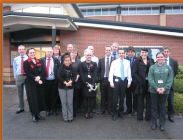
Delegates from Bentley Motors

Importantly, the Project has resulted in the development of a Learner / Employer Engagement Model. While the model illustrates a best practice approach within STEM disciplines, the principles can easily be adopted by, and adapted to, other sectors.