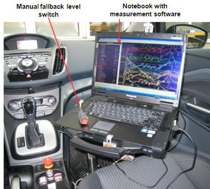
Figure 4. Notebook with Datalyser Software.