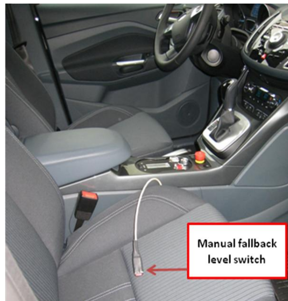
Figure 1. Manual fallback level switch.

The procedure of this internal test run was that the proband drives at first with functional service brake system, in order to adapt to the test track. The main driving task for the test drive was a spot brake maneuver in each round on the testing ground. After two rounds on the test track the instructor on the passenger seat could activate the fallback level mode with a manual switch (Figure 1) unnoticed from the driver.