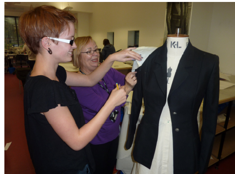
Fig 3 and 4 Tailoring class at University of Huddersfield

A small number of educational establishments in the UK, have responded to this need by reinstating a thorough understanding of the heritage of technical skills within their curricula, or have developed courses and specific modules to capitalise on traditional industries. The BA (Hons) Fashion Design Courses at University of Huddersfield, include a compulsory tailoring module in their year two programmes of study. Each student is required to cut and make a tailored jacket for a size twelve figure. Whilst not a made to measure garment, it is