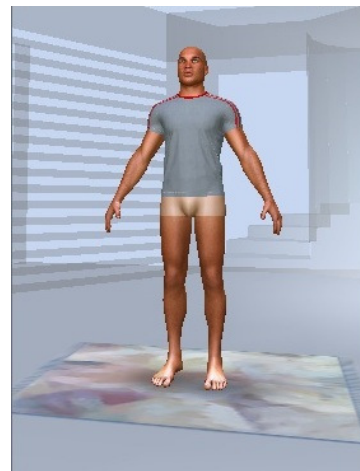
Virtual Simulation Using Fabric One Properties