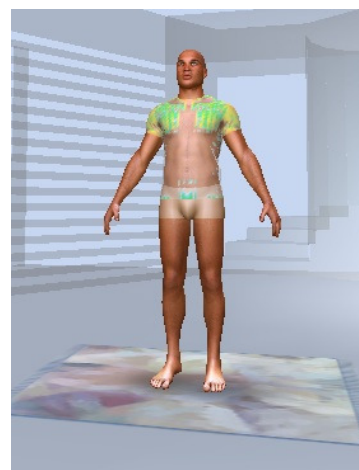
Pressure Simulation Using Fabric One Properties