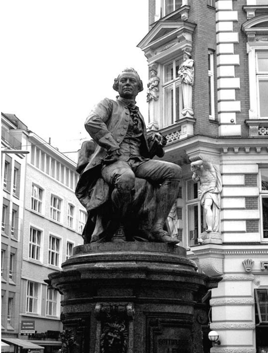
FIG. 1 Gotthold Ephraim Lessing on a pedestal in the Gänsemarkt in Hamburg, the site of the Hamburgische Nationaltheater from 1767 to 1769. The monument by Fritz Schaper was erected in 1881.

Germany's first 'Actors' Academy', for their part tried hard to accommodate their art to the new requirements of being judged according to their embodiment of a script, of being physically 'readerly' – and criticizable. In Ekhof's concluding address to his Actors' Academy, he summarized the qualifications actors should bring to their profession: