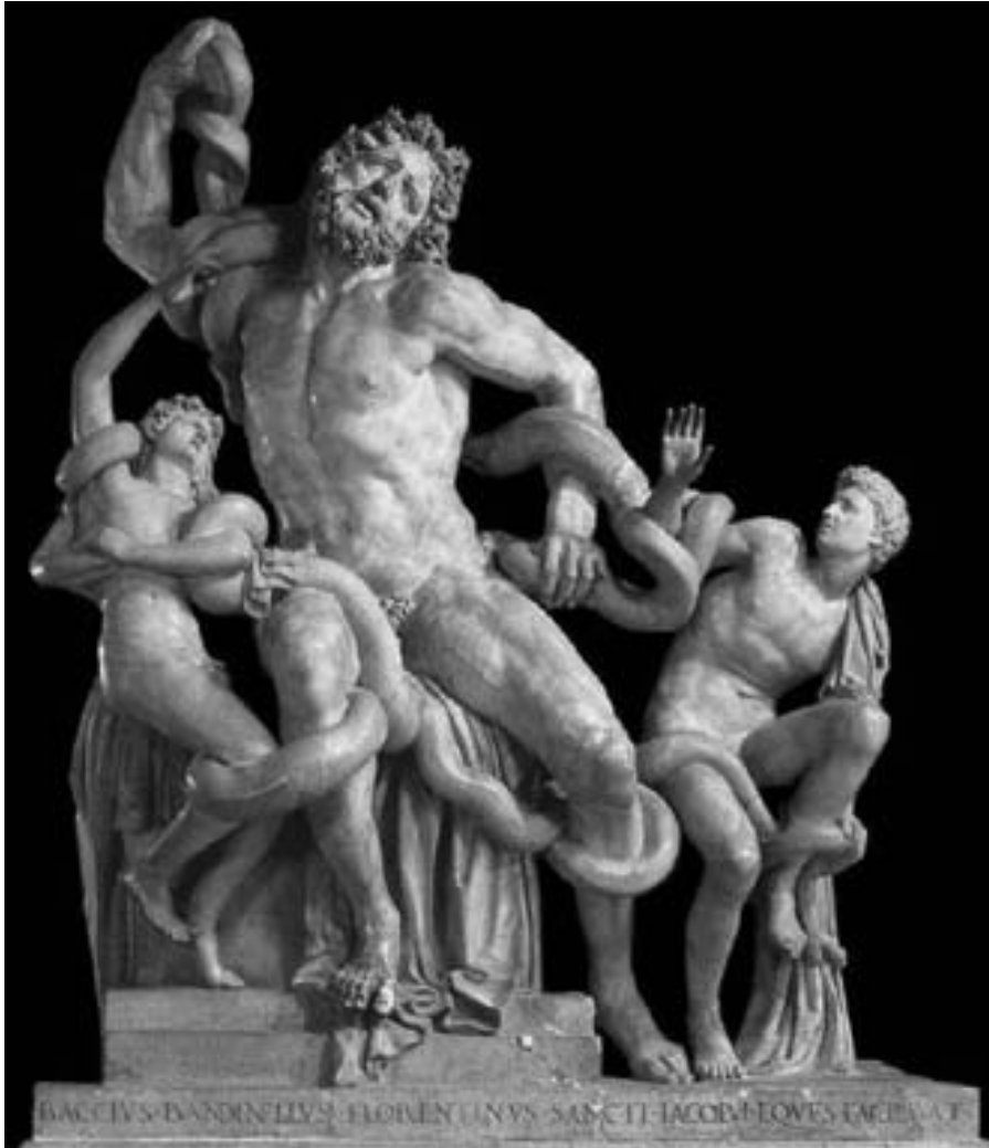
Fig. 2 The Laocöon group, Vatican museum, Rome.

on how Lessing deals with the disruptive aspects of corporeality and relate Lessing's aesthetic and dramatic production to Jacques Lacan's theory of subject formation and Julia Kristeva's theory of abjection. 30