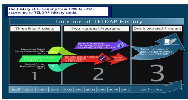
Figure(2): showing the development stages of Taiwan E-learning and Digital Archives Program

The Libyan business executive survey/global competitiveness report (LBES/GCR) ranks Libya 97th out of 111 countries in university/industry research collaboration (Porter & Yergin, 2006). However, there is agreement among a number of Libyan educators that students on postgraduate programmes in Libyan universities encountered the following difficulties: Absence of a plan for building the human cadre needed by society; Absence of effective administration; Lack of staff development Libyan HE. It is only recently that structured staff development has become available to academic staff; Shortage of research activities in science and engineering in Libyan HEIs due the lack of necessary facilities.