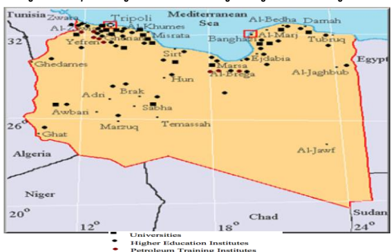
Figure (3): Higher education institutions in Libya (Rhema & Miliszewska, 2010).