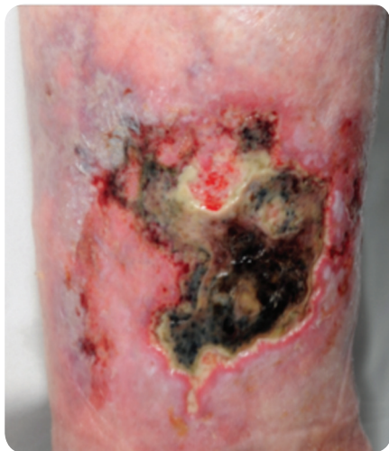
Figure 2. Ulcer at presentation.