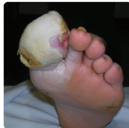
Figure 5. Infected toe in newly-diagnosed patient with diabetes.

Mr W sometimes complained of pain, especially at dressing change. The ulcer was diagnosed as being venous in origin and he was started on 4-layer compression bandaging to reduce the venous insufficiency and promote healing. Activon™ tulle dressings (Advancis Medical) were used to rehydrate the slough and eschar. These were topped with Advazorb Silfix soft silicone faced adhesive foam dressings, to ensure that the wound bed was kept moist while simultaneously coping with any increase in exudate caused by the honey rehydrating the wound bed. Advazorb Silfix soft silicone is also designed to minimise pain and trauma