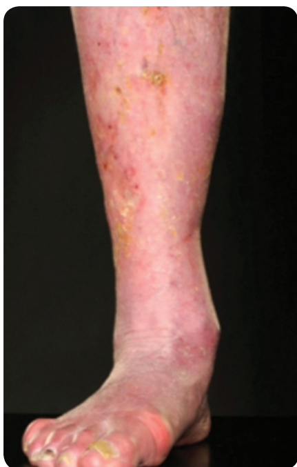
Figure 4. Fully healed after eight weeks of treatment.

in the author's clinical experience, foam dressings provide the perfect balance between fluid-handling capabilities and maintaining moist wound healing.