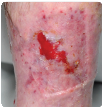
Figure 3. Mr W's ulcer at four weeks since referral.