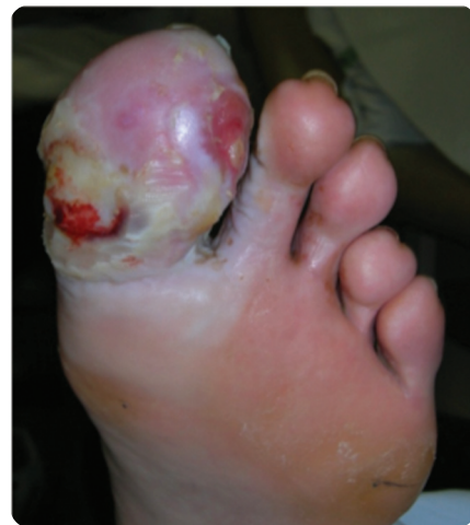
Figure 6. 48 hours after treatment with Advazorb.