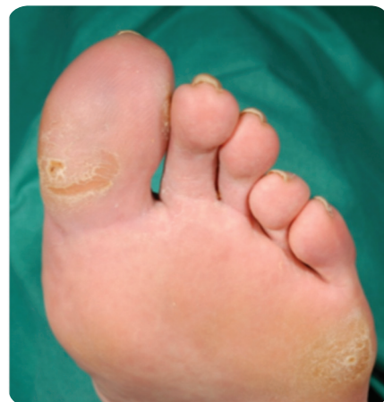
Figure 7. Complete healing after three weeks of treatment.

at dressing change, thereby ensuring that the surrounding fragile skin and newly-formed granulation tissue is protected.