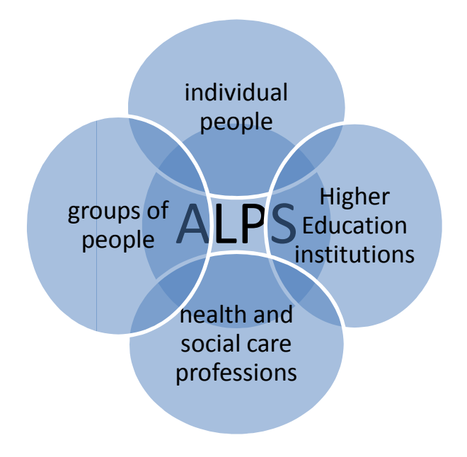
Figure 2 'We got further than we would have done on our own'

their profession across several HEIs, as well as bringing their own personal skills and beliefs.