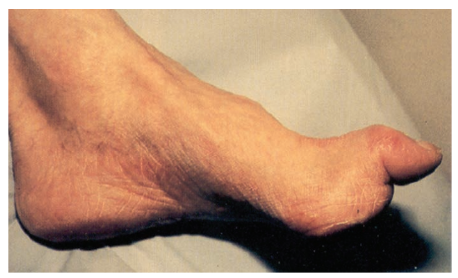
Figure 2. Typical clinical presentation of foot affected by polyneuropathy.