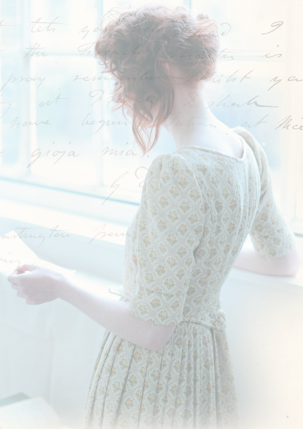
handwritten text scanned from "The Face without a frown" by Iris Leveson Gower.