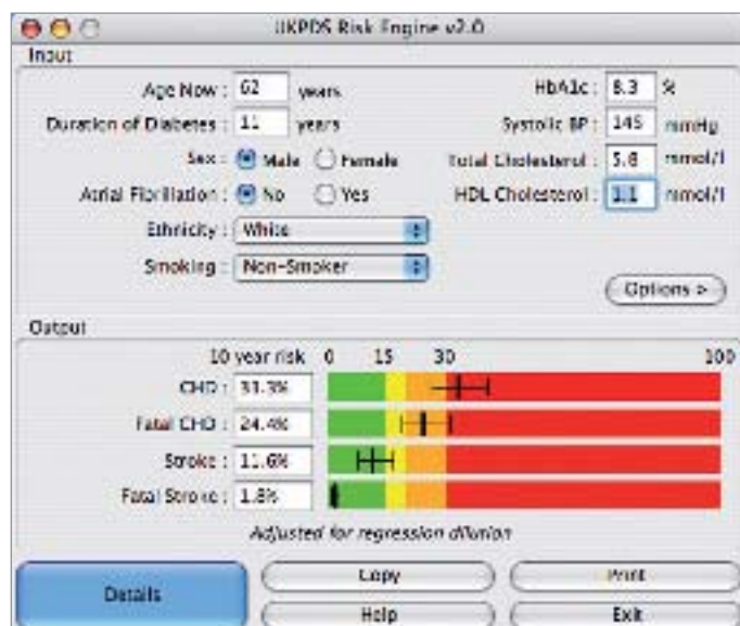
Figure 4. The UKPDS Risk Engine (available at www.dtu.ox.ac.uk/index.php?maindoc=/riskengine/ )