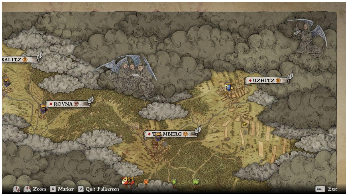
Figure 4. Screenshot of a portion of KCD 's main map.

KCD 's representation of the Middle Ages runs deeper than the more obvious visual and ludic elements referred to above. Other aspects of the game, explicit and implicit,