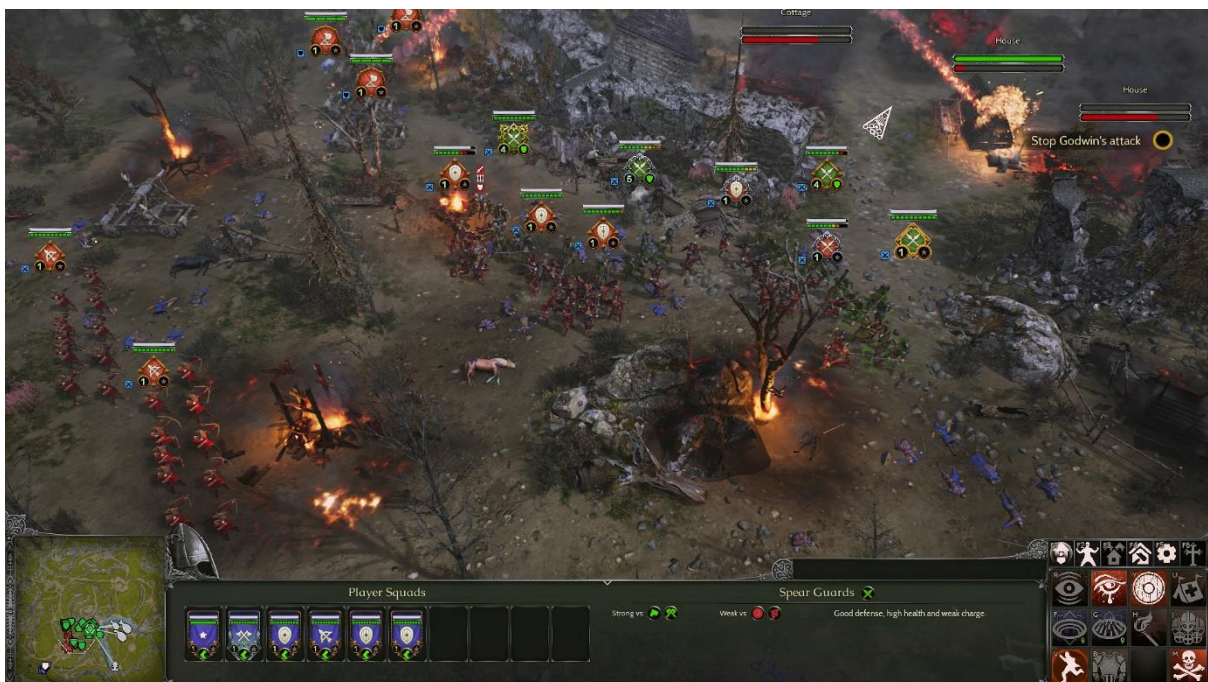
Figure 8. A screenshot of a typical battlefield in Ancestors Legacy.