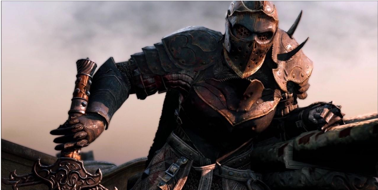
Figure 2. Apollyon during the final mission of For Honor .

campaign, Apollyon, is a woman and arguably the strongest character in the game (see Figure 2). She is the ultimate warrior, portrayed as the embodiment of war and death. In the multiplayer, seventeen of the currently available heroes are playable as female (out of a possible twenty-five) and are given looks and abilities equal to that of the men. Here, the gender of the player becomes as irrelevant as that of the characters. They need not be male to play as a female, nor do they need to be female to play as a male. With the power to be equally successful as either gender, the game offers gender fluidity and performance similar to that which Mayer and Wilkins have recognised in MMORPGs. 148 The game's representation seems so diverse that it becomes almost inconsequential, and intentionally so. One can only speculate, but perhaps the balance between male and female power was done deliberately as to make gender a non-issue, ensuring it did not detract from the game's primary experience of combat. Inevitably there have been some individuals to criticise the developers for what they see as a 'SJW [social justice warrior] stunt'. 149 It must be said, however, that this criticism is small scale in comparison to the backlash games such as Battlefield V have faced. This is probably due to the fact For Honor does not explicitly or implicitly claim to be an accurate portrayal of history. Its heavy fantasy element has likely