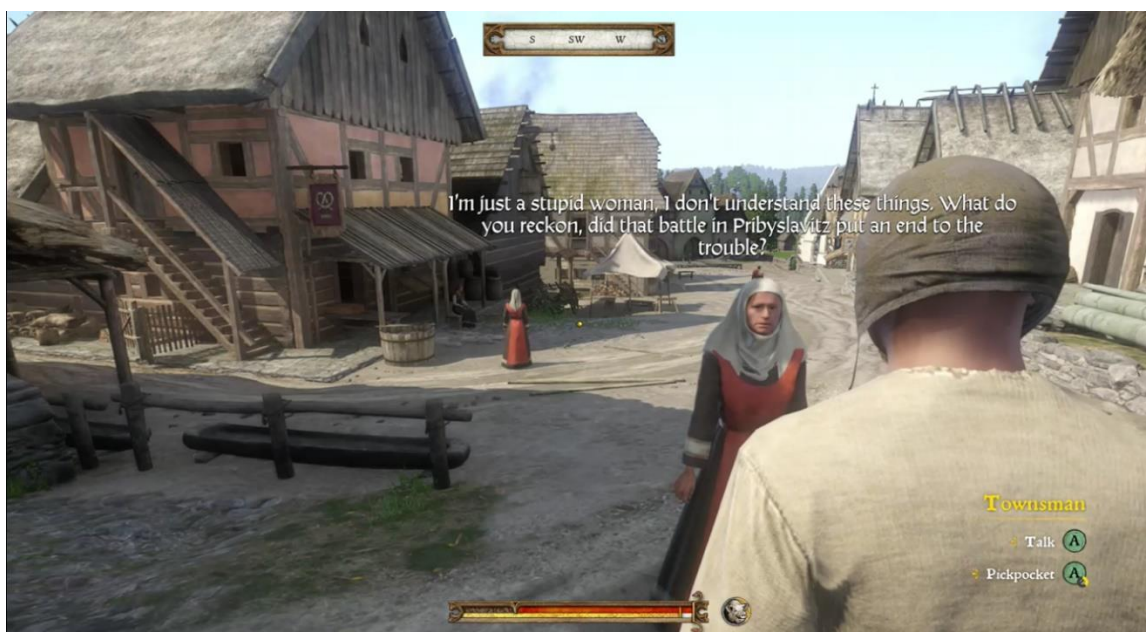
Figure 5. Screenshot of a "stupid" woman in KCD.

However, the overwhelming feeling in the game, made most apparent in NPC dialogue, is that women were looked down upon as unskilled, weak and stupid. For instance, during the quest Aquarius , when finding jobs for the refugees of Skalitz, Theresa recommends the job of water-carrying go to a woman named Antonia because of how difficult it is for women to find work. When informing the Bailiff of the decision, he remarks, “What, a woman? It’s a long walk with a heavy load. Man’s work.” This perceived weakness may be a feature of medieval (and indeed modern) misogyny, but the game takes this further with some NPC dialogue that appears to suggest that women held a conscious view of their own inferiority. Figure 5 supports this, with the townswoman admitting to not