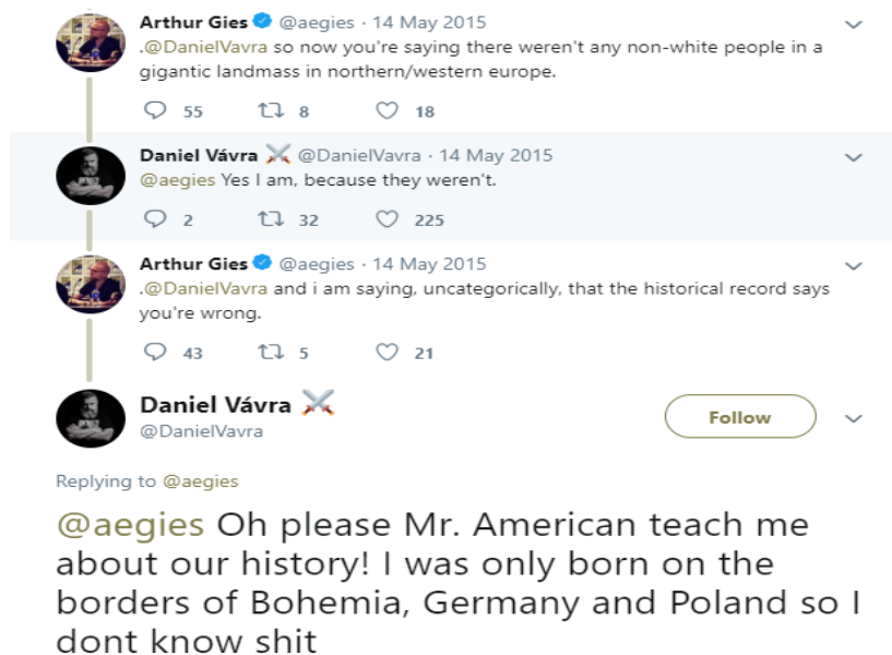
Figure 6. A tweet by KCD's creative director, Daniel Vávra, in defence of the game's whiteness.

Some claim that Warhorse Studios’ exclusion of minorities is baseless and founded upon nothing more than the developers’ white privilege. They point to the comments and views of their creative director, Daniel Vávra, as evidence. Vávra came under heavy criticism in 2017 for wearing a shirt during Gamescom (a highly publicised trade fair for gaming companies) that depicted an album cover by the band “Burzum”, a Norwegian black metal