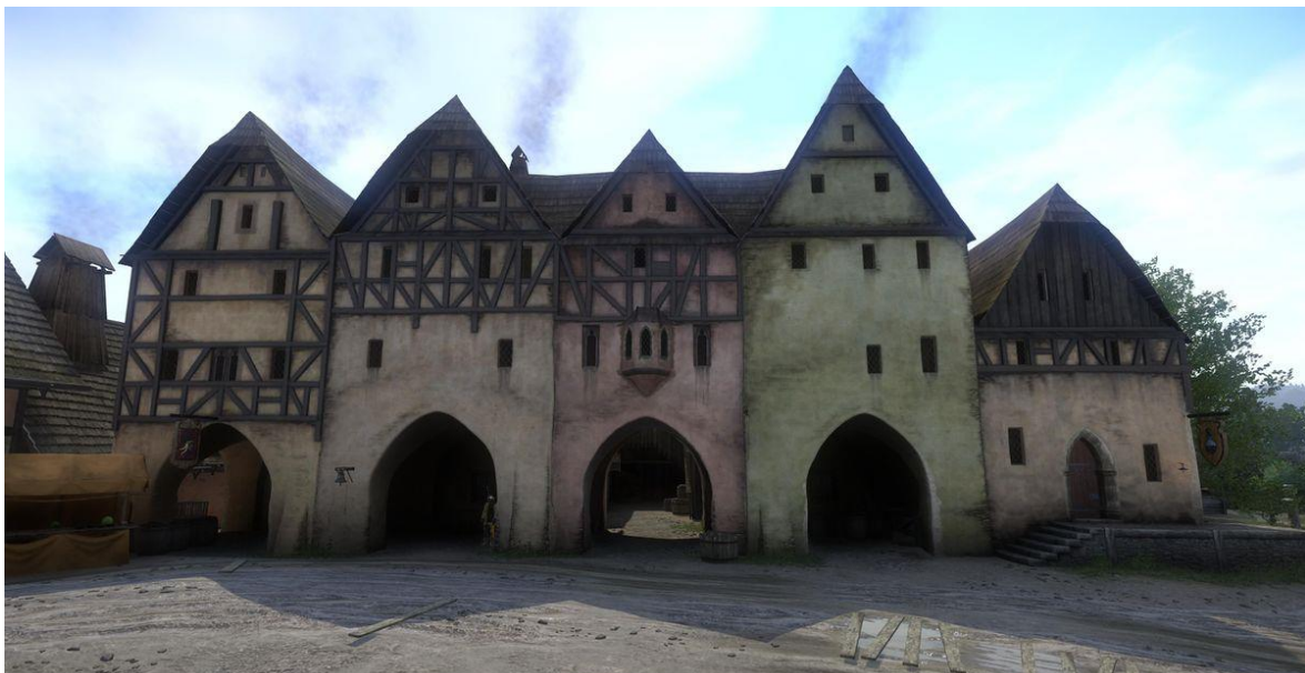
Figure 3. Screenshot of the Rattay Rathaus in KCD .

As with all realist simulations, it is within KCD 's audio-visual aspect where the majority of data lies. 163 So too do the aesthetics of historical description. As previously mentioned, the research conducted by Warhorse Studios was done to ensure the visuals appeared as authentic as possible, taking examples from galleries and museums, as well as archives and libraries, and implementing them (where technically possible) in the game. Castles, houses, books, furniture, greetings – they are all (mainly) cosmetic in their function, serving as historical descriptors that make for a more authentic representation.