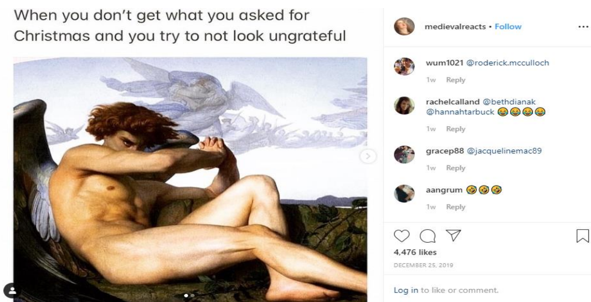
Figure 1. Screenshot of the medievalreacts ' Instagram page, popular for its memes.

In his 1986 assessment of the West's renewed interest in its medieval past, Umberto Eco wryly remarks, 'it seems that people like the Middle Ages'. 1 Now, in 2020, this assertion is more appropriate than ever. The permeation of the medieval into all aspects of the modern media – cinema, television, radio – has continued into the new millennium where, accelerated by the influence of the internet, it has expanded even further into popular culture. This modern representation of the Middle Ages has come to be known as medievalism. The term has a complex semantic history, complicated further by the creation of new terminology. Neomedievalism, for example, is now used by some to describe the medievalism of popular culture. 2 For others, this differentiation is unnecessary as 'the "-ism" suffix is sufficient and marks the mediated nature of all medievalism'. 3 This study has no interest in semantics and therefore will simply use the term medievalism to denote any 'creative interpretation or recreation' of the European Middle Ages. 4 The use of medievalism in popular culture has become far more frequent and, as Andrew Elliott points out, considerably more 'banal', with even memes and advertisements (see Figure 1) now