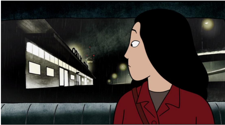
Figure 2.5: Marjane leaves the airport as the unified testimonial 'I'.