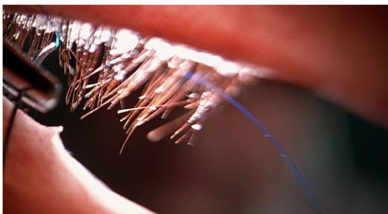
Figure 3.1: The stitching closed of Jean-Do's eye from his subjective perspective.

Adopting the literal perspective of the subject not only invokes the documentary invitation that prompts viewers' expectations of truth-telling (Plantinga, 2010), but also places the