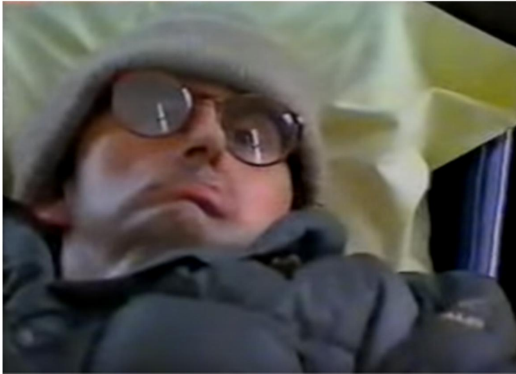
Figure 3.2: Jean-Dominique Bauby at Berck-sur-Mer in Assigné à Résidence (Beineix, 1997).