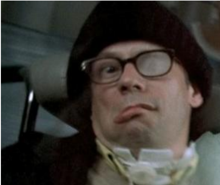
Figure 3.3: Mathieu Amalric as Jean-Do in The Diving Bell and the Butterfly (Schnabel, 2007).