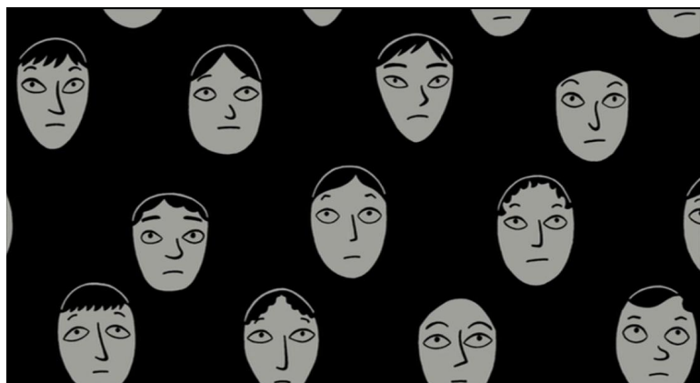
Figure 2.3: Marji at the centre of her classmates and the merging of their veils.

the veil and observing the ritual, but without any real belief or conviction, and whilst flouting the ban on modernity – or ‘Western decadence’.