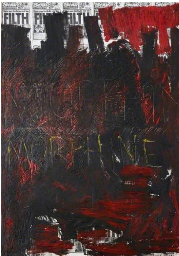
Figure 1.8: Jarman's 'Morphine' . 12

of a 'they', but as an 'I'" (Peake, 1999: p. 320), asserting his individuality as part of a community as an emissary instead of a metonymic representative. Indeed, Jarman's body of work is unequivocally reflective of his political and personal perspective, offering essential context for the testimonial register of Blue . Accordingly, viewing Blue through the testimonial agenda of self-witness, and as a deliberately autobiographical act requires that the viewer "shuttle" (Felman and Laub, 1992) between this historical framing and the film text, as metatextual engagement with Jarman's artistic legacy provides context for his testimony in the absence of the autobiographical body.