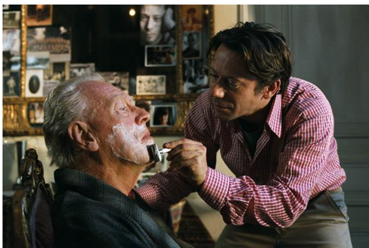
Figure 3.4: Jean-Do shaves Papinou.

The lyrical description of this scene is visually rich, littered with precise observations of colour and texture that summon not only images, but also the materiality/material precarity of the man and his environment in a phenomenological rendering of nostalgic and relational empathy. This cinematic description is carried through to the filmic adaptation in detail (see Figure 3.4) , right down to John-Do's (Mathieu Amalric) use of a live blade for the shave to ensure that appropriate levels of care and bodily tension were achieved, with the authentic sound of steel scraping stubbly skin a particularly resonant phenomenological prompt. Bauby's descriptions of his father – affectionately referred to as Papinou in the film – are fastidiously realised in Max von Sydow's cinematic performance, from the aesthetic to the characterisation. Von Sydow himself said "it was not difficult to do this character. It was all in the text" (von Sydow in 'Submerged', 2008: 7:00-7:05), and the chemistry between von Sydow and Amalric is authentically fraternal on screen.