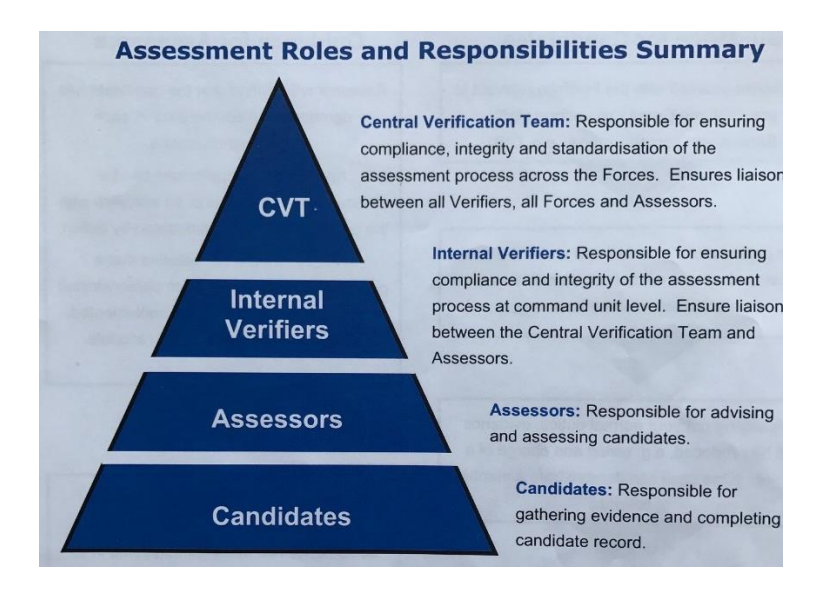
Figure 1: Assessment Roles and Responsibilities Summary (NPIA Investigative Skills, August 2009)

The university included the portfolio as an assessed module, subject to strict time management but working closely with the crime trainers at the training school so that the portfolio could be submitted within six months of the last day of the trainee's course "it is important that this time limit is adhered to, in the event that the submission date is missed it will result in the trainee failing the module" (Policy Document, 2012, p. 9). This did fall within the time frame recommended by the NPIA, but this last phase became administratively bureaucratic and problematic, particularly for the trainee in relation to time management and support afforded by the organisation. The completion of the portfolio and support by detective tutor are themes which form part of the analysis section in chapter five.