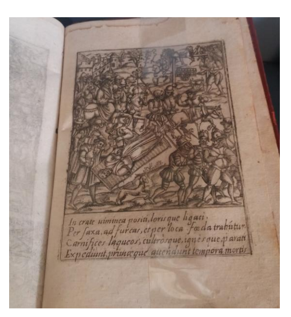
Figure 3: By the permission of the Governors of Stonyhurst College: A book titled: A True Report of the Life and Death of Edmund Campion written by Richard Verstegan (Jesuit) who witnessed Campion's execution.

Figure 4: By the permission of the Governors of Stonyhurst College: A reliquary holding the rope relic of Edmund Campion