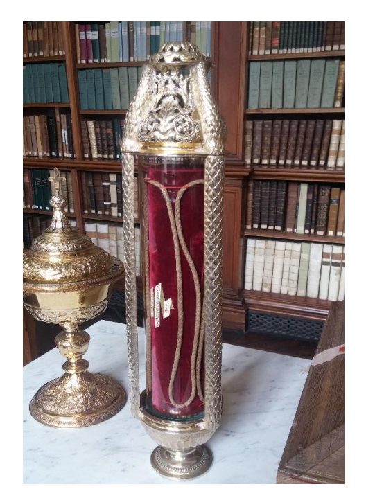
Figure 4: A reliquary holding the rope relic of Edmund Campion

quartered. As a result, the regime sought those who had helped him, which 'culminated in a range of new statutes aimed at making the lives of English Catholics altogether more difficult'.<sup>232</sup>