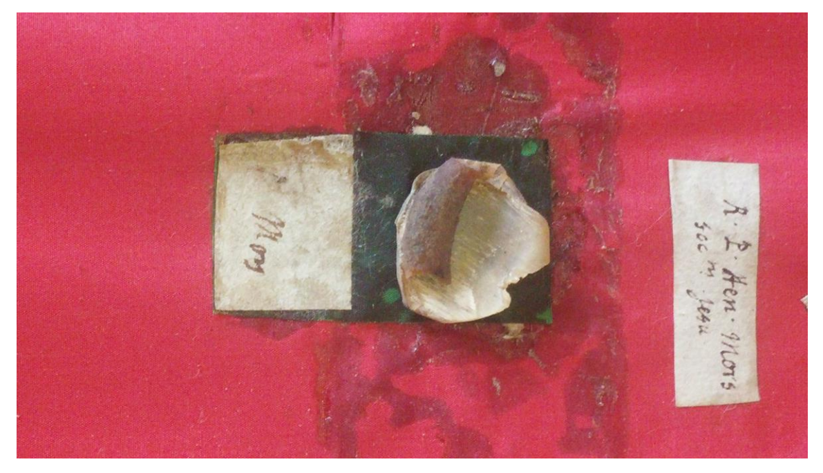
Figure 2: By the governance of Stonyhurst College: The toe nail of Sir Thomas

his memory (now kept at Stonyhurst college).<sup>212</sup> Below is an image of one of More's relics. The fact that such a small direct relic was collected and preserved shows that for Catholics there was no part of the saint's body that was not precious enough that could not offer the same kind of miraculous power as any other.