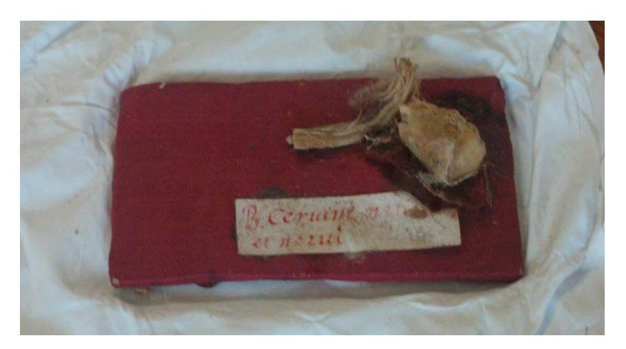
Figure 5: A piece of bone belonging to the saint Ralph Sherwin

Shortly after Campion was executed, Ralph Sherwin, an English Catholic priest, followed and a piece of his bone was collected and preserved; this can be seen below. It is a small piece that could have been easily hidden and transported around the country.