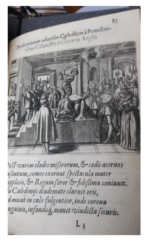
Figure 6: A depiction of Mary, Queen of Scots execution

alive that martyr and thus fortifying the community of the faithful'.<sup>237</sup> Whilst all relics had a holy significance, 'blood's metaphorical mutability made it a powerful vehicle for promoting older devotional practices and images'.<sup>238</sup>