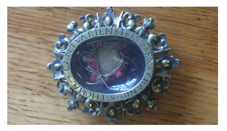
Figure 1: A reliquary holding a piece of skull belonging to St Thomas Becket

of Becket, a piece of his skull, which was placed in a silver reliquary to protect the bone. The image below provides evidence that at least part of St Thomas' relic survived; in this case the relic was sent away from England and kept in safety in Esztergom, Hungary for centuries.<sup>150</sup> There are obvious problems with this as there is no way of knowing if the piece of skull below is actually from St Thomas Beckett or not which in turn illustrates the problem with using material culture. Wrapped in a piece of red velvet there is extreme care taken with the bone to make sure that it was not damaged and yet was still visible supposedly to prevent claims of fakery. The reliquary that it is contained in is small enough for it to be concealed whilst in public, it would have allowed whoever possessed the relic to move freely about without attracting unwanted attention which might have resulted in persecution. The fact that this piece still exists supports the argument that relic materials from the medieval period were protected and held sacred in secret, Catholics afforded them sanctity and protection from Reformers by sending them to the continent for protection.