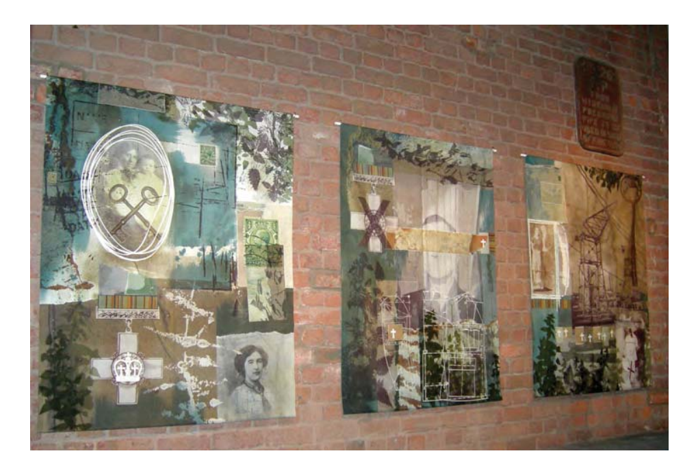
Figure 5: 'The Ties That Bind (I)' in situ at Manchester Museum of Science and Industry.

The textiles were exhibited at UK sites, deliberately without provision of a title or content description. The 'Ties That Bind (I)' was displayed in 2007 at Walford Mill in Dorset (a contemporary craft gallery), Lloyds Bank headquarters in Birmingham, Manchester Museum of Science and Industry (Figure 5), and Saltaire United Reformed Church. Self-administered questionnaires were placed with the installation and the researcher also undertook one-to-one voice recorded interviews with 46 participants at the sites. The 'Ties That Bind (II)', a reworking of the visual narrative, was later displayed in 2008 at Manchester Museum of Science and Industry and the Bankfield Museum and Art Gallery, West Yorkshire (Figure 6). Self-administered questionnaires were again available with the installation.