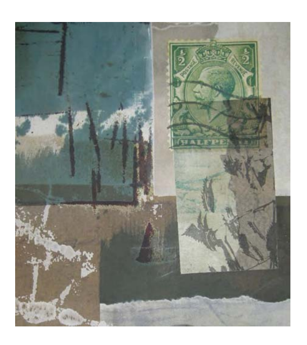
Figure 4: Stamp detail from 'The Ties That Bind (I)'.

and connote 'for king and country' (Figure 4). White crosses, incorporated as symbols of Christian faith, emerged as common elements across all the panels as the work progressed. Additional elements such as a white feather (a symbol of cowardice), and keys to symbolise imprisonment and release, were also included to develop the narrative content.