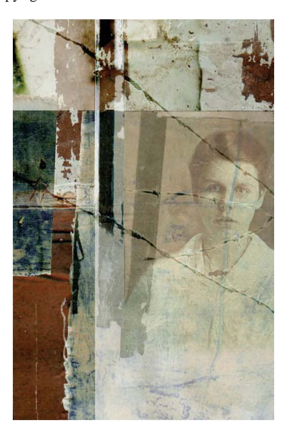
Figure 7: Image detail from the development of the 'The Ties That Bind (II)' centre panel. Image copyright of the artist.