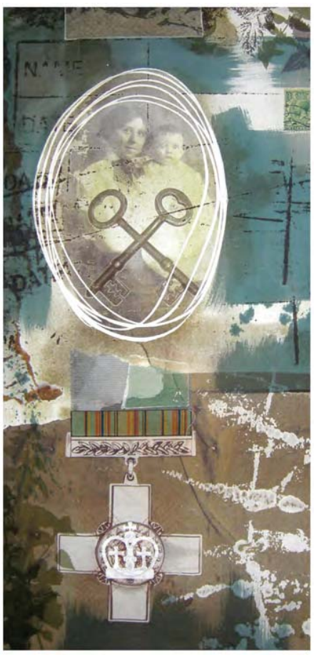
Figure 3: Left: details of digital additions to the collage background. Right: with additional screen print, stitch and bonded fabric additions. Image copyright of the artist.

The physical separation of the narrative into three panels for 'The Ties That Bind (I)' enabled a staged construction of meaning to be established for the viewer. The family photographs were a vital element in the construction of this visual narrative. However, the encoded authorial intentions for the images relied heavily on their compositional juxtaposition with other elements to create meaning beyond basic significations of the maternal or familial. A visual syntagm had to be created in the first panel to communicate that the family had been singled out for their pacifist beliefs in wartime. This began by positioning beneath the mother and child a crossed-out medal to connote lack of bravery, and by positioning the pattern for a military uniform over the image of another female relative from the period (Figure 3). Stamps were included to identify the period