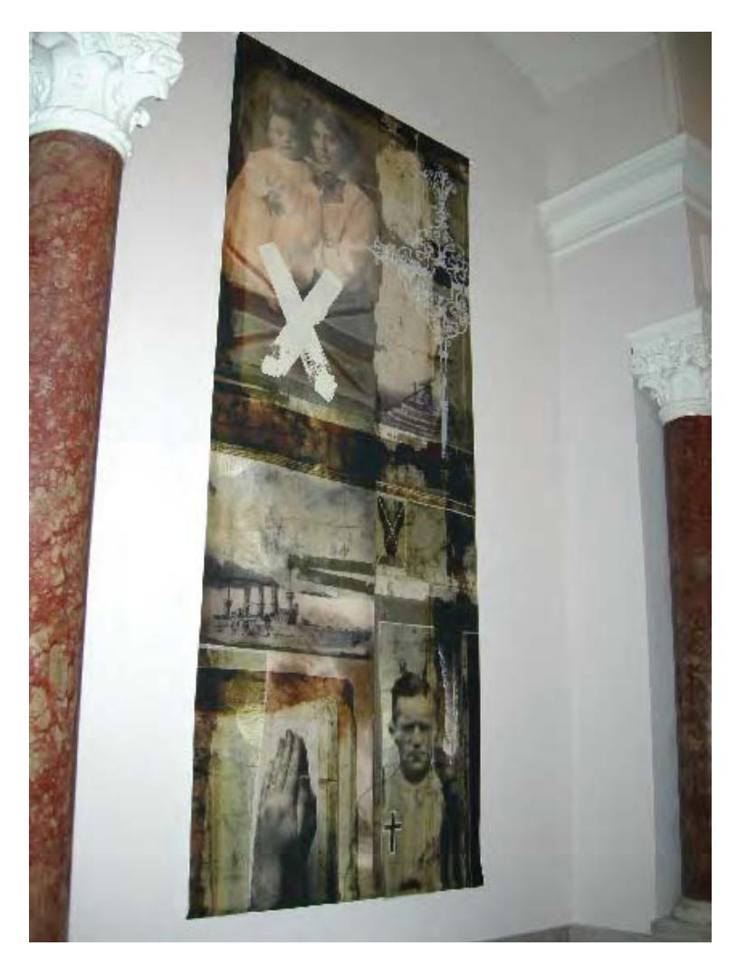
Figure 9: 'The Ties That Bind (II)' Panel 1'.

misinterpreted the flag as a gate. At a primary level of signification <sup>12</sup> the flag did denote 'British', 'national' and 'country' to most viewers. The secondary level of signification, the connotative meaning viewers interpreted from the image, was split between negative and positive associations. These included: "Ambiguity of serving England, propaganda," "Rejection of nationalism," "Rejected by church and country,' and conversely, "Flying the flag for Britain" and "Patriotism, home."