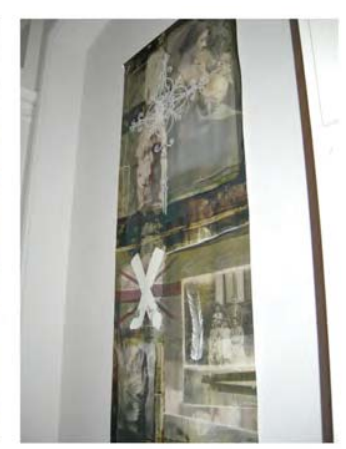
Figure 6: 'The Ties That Bind (II)' in situ at the Bankfield Museum and Art Gallery.