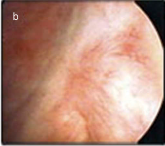
Figure 3. The presence of a marker lesion prior to (A) and after (B) a 6 week course of apaziquone. The results were first presented in the review article by Phillips et al, reproduced with permission [6].