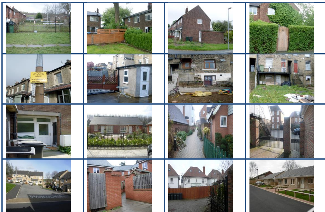
Figure Two: 16 Images

The images were taken in a variety of different locations across England. They included a mix of old and new properties, social and privately owned housing. There were, unavoidably, prior assumptions from the researchers involved (who selected the