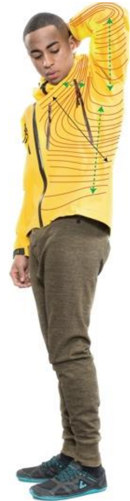
Visual analysis of hard shell jacket. Langer's lines are marked with thin red lines on the torso and arm.