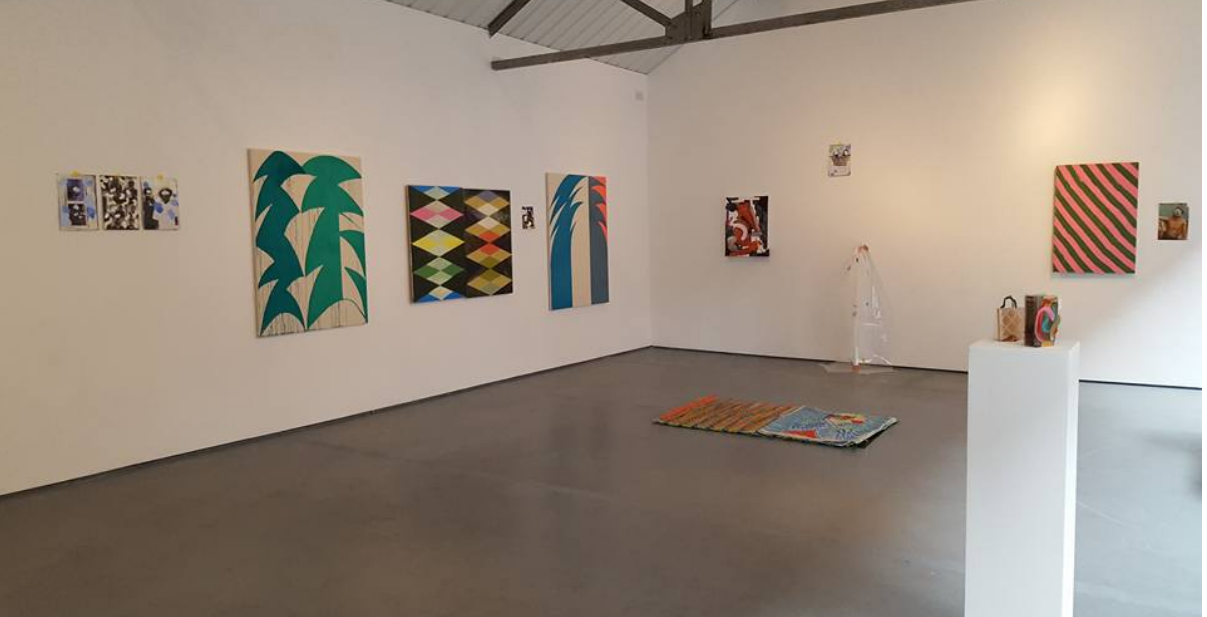
Installation shots of the exhibition The Painting School (New Materialities) , Bloc Projects, Eyre Street, Sheffield, 23 - 30<sup>th</sup> September 2016