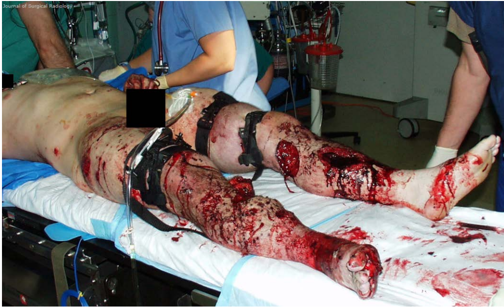
Figure B –Shrapnel wounds