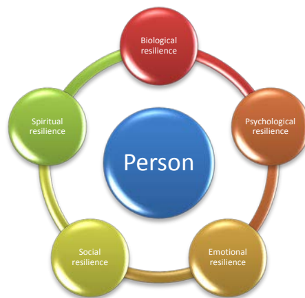
Figure 1- The Edward model and domains of resilience 23

Using the resilience model as a conceptual framework healthcare professionals can engage with people towards resilience within the context of their personal experience of ill health. Self-management and self-righting capabilities are now being considered integral to reducing the