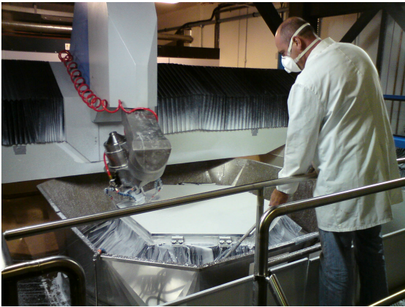
FIG. 1 Segment polishing on Zeeko IRP1600 machine at the National Facility.

support polishing conducted on-machine. Meanwhile, ESO has opted for a process-route polishing circular blanks, cutting hexagonal, followed by ion-beam figuring. Therefore, a fourth, circular segment has passed acceptance, completed to a more stringent mid-spatial specification demanded by ESO [7].