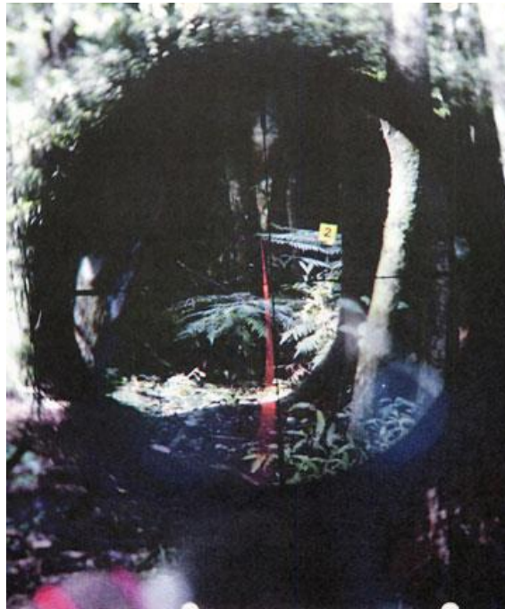
Figure 1 - Line of sight reconstructed by New Zealand Police