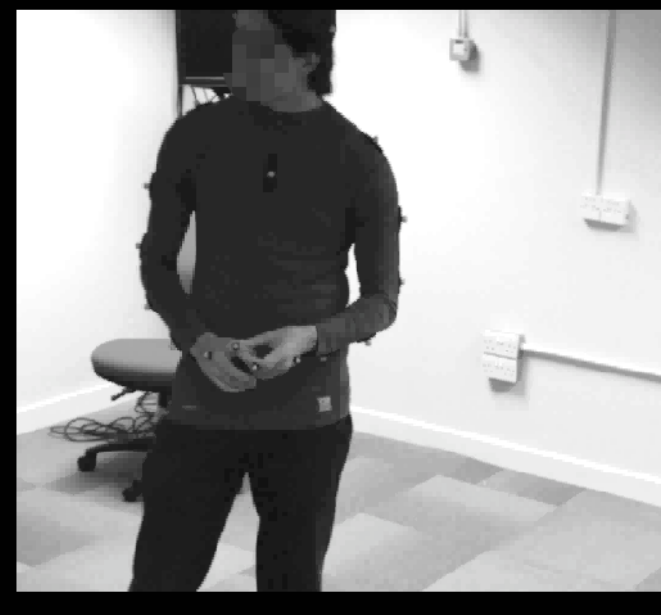
Figure 1. A participant wearing the motion tracking shirt and hat (right) and the 3D position of the markers reconstructed by the motion tracking system (left)

both practical and theoretical goals, is an automated system which will record accurate bodily changes and provide an objective approach to the study of deception (Burgoon et al., 2005; Vrij & Mann, 2004). Such a method, we believe, must be able to maintain the complexity of continuous variables.