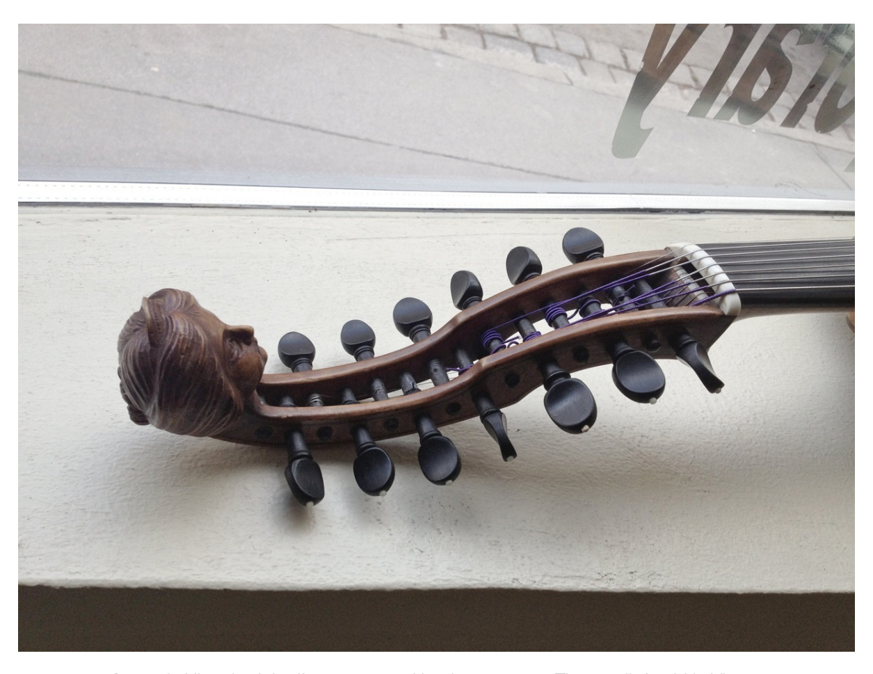
Figure 3: Historic viola d'amore owned by the company Thomastik-Infeld in Vienna.

like in the Vienna Philharmonic Orchestra in 1997 (Bennett, 2008, p.53). Instrument makers historically had a preference to decorate such instruments with female figurines or heads (see Figure 3). In the case of the viola d'amore, these figurines were at times blindfolded. The resonating strings are often referred to as 'sympathetic strings'. The viola d'amore was frequently used in feminine contexts, or in connection with female main characters, by (mostly male) composers such as Leoš Janáček, or in Bernhard Herrmann's film music.<sup>2</sup>