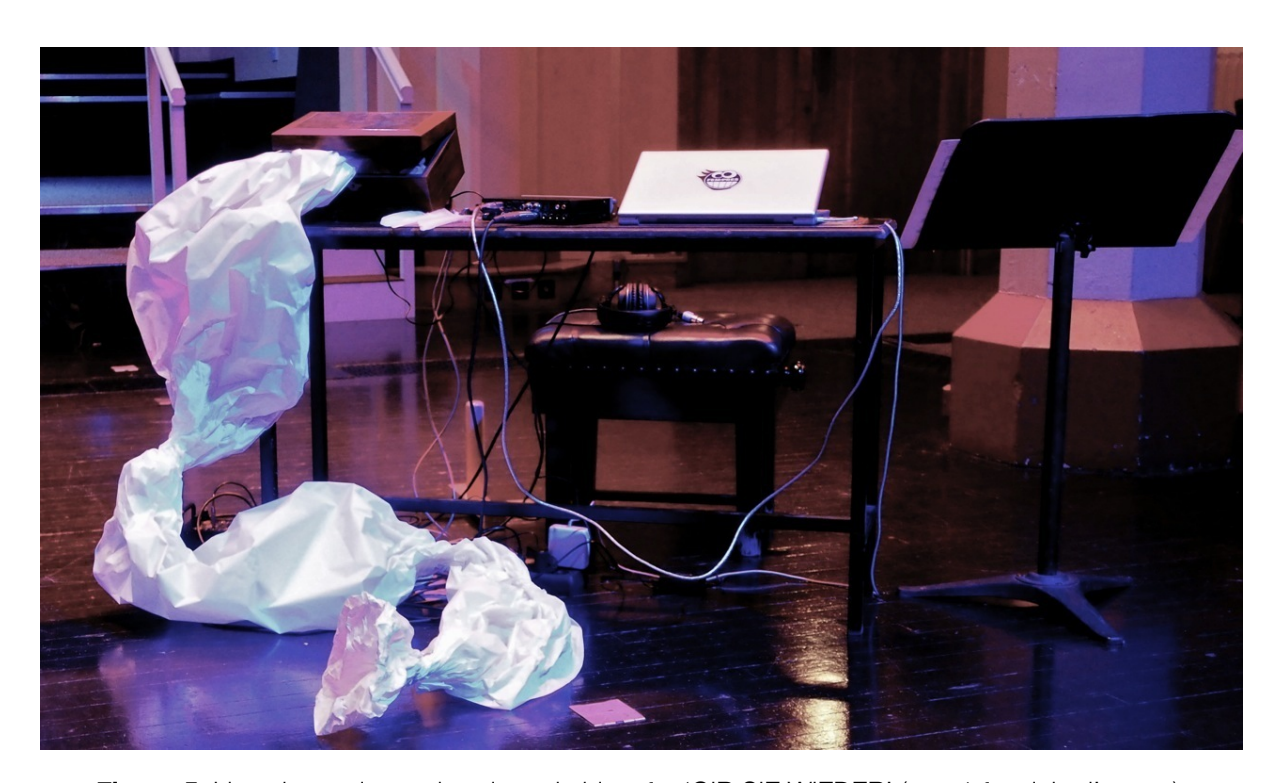
Figure 5: Live-electronics and sculptural object for 'GIB SIE WIEDER' (part 1 for viola d'amore).

created a sounding object from a beautifully crafted old wooden box, paper and feathers. The exciters are fixed invisibly to the back of the box. The amplified resonant strings of the viola d'amore are transduced (via live electronics, computer and sound-card) into the box, throughout the entire piece, turning the sculptural assemblage into a sounding object. The paper element of the sculpture (see Figure 5) that reaches from the bottom of the box to the floor, appears to vibrate. The wooden box acts as a lo-fi effects unit: it colours the sound. Furthermore, by opening and closing the lid, I can vary the resonant frequencies produced.