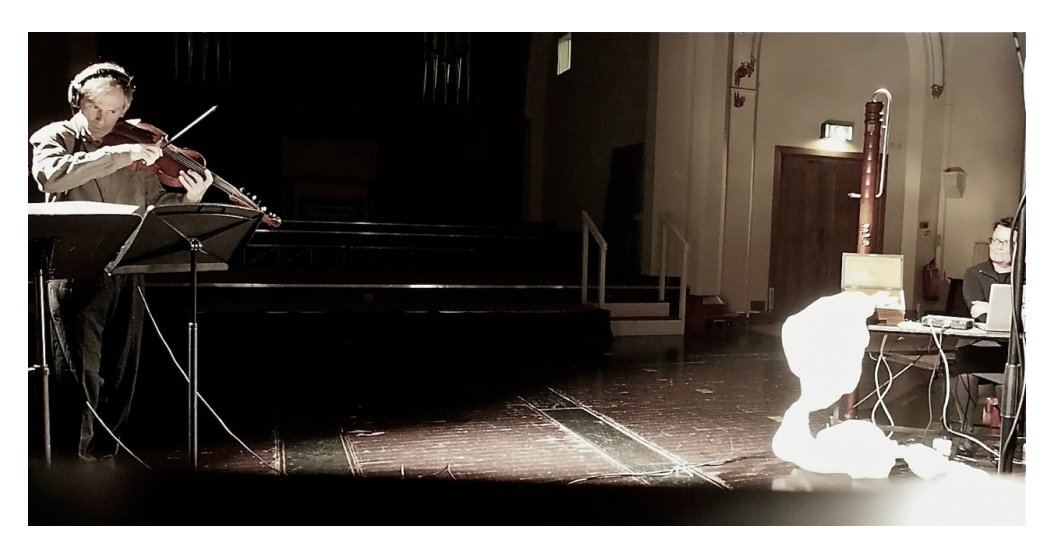
Figure 1 : Garth Knox performing from an audio-score.

'GIB SIE WIEDER' began with the composition 'a warning commentary on resonance I', featuring Garth Knox performing on viola d'amore (see Figure 1). The second piece 'a warning commentary on resonance II' followed shortly afterwards and is dedicated to the harpist Rhodri Davies (see Figure 2).