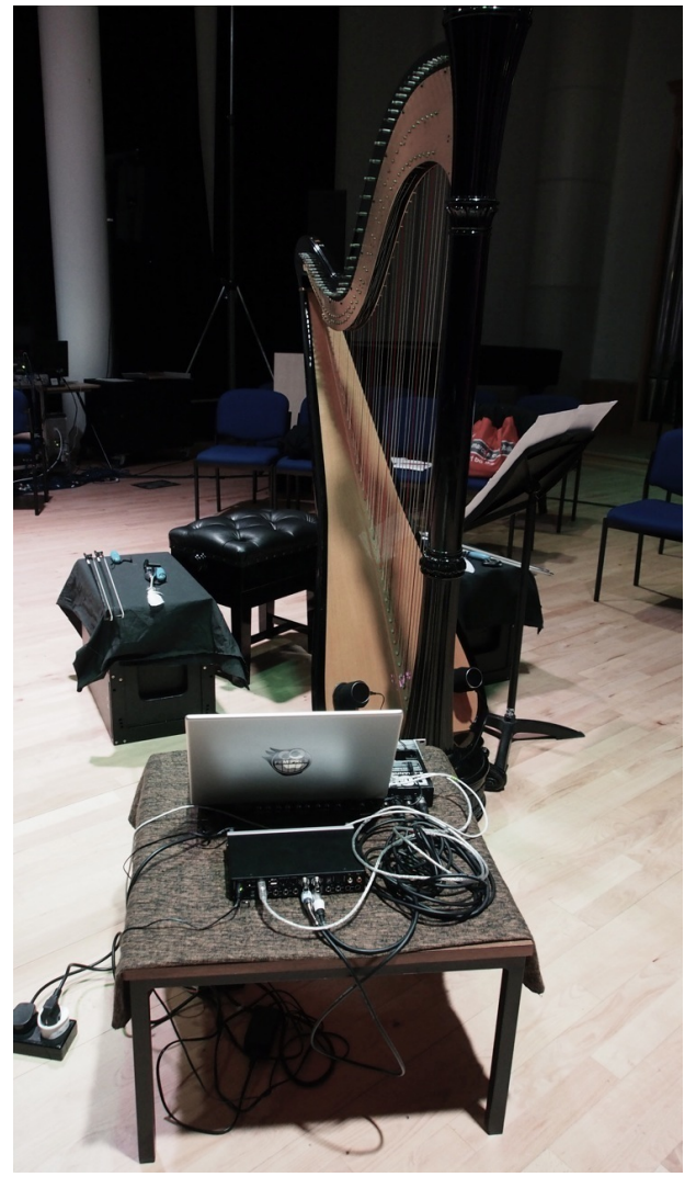
Figure 6: harp and speaker setup for performance.

now functions as a sounding object, in addition to a musical instrument (see Figure 6). If a performer plays live, as an 'outside' harpist, in addition to the 'inner' part, the resonant frequencies caused by the electronic track and by the live performance radiate together from the same source, and also directly interfere with each other. As with the box, the sound of the playback is slightly transformed by the resonance of the harp.