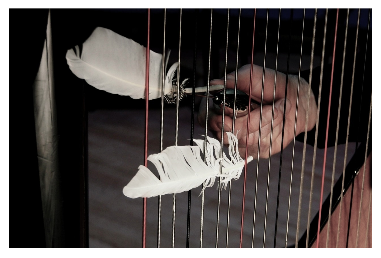
Figure 9: Feathers as tools for sound production.

discovered some interesting sonic results such as a soft vibrating flutter, produced by stopping a vibrating metal string with the tip of a feather. This produces a sound a little like that of wings against a cage. Harpist Rhodri Davies brought up the idea of rotating feathers with an electric milk whisk, which not only gives beautiful sonic results, but is also visually effective on stage. White feathers rotate like the wings of a humming bird (see Figure 9). Feathers provide abundant symbolic imagery, resonant of freedom and artistic expression. For hundreds of years they have been used as tools, by writers, composers and in instruments (the strings of a cembalo are plucked with small pegs made from quills). Artists in former times often posed with a white goose feather in the right hand.