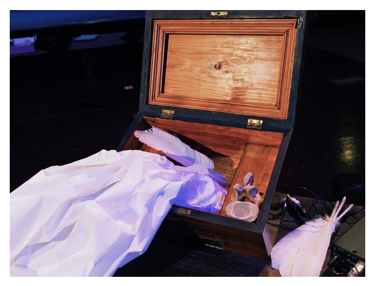
Figure 7: Sounding object for the transduction of the viola d'amore.

nonverbal input heard only by the performer and becoming increasingly foregrounded until it becomes a clearly audible female voice on stage.