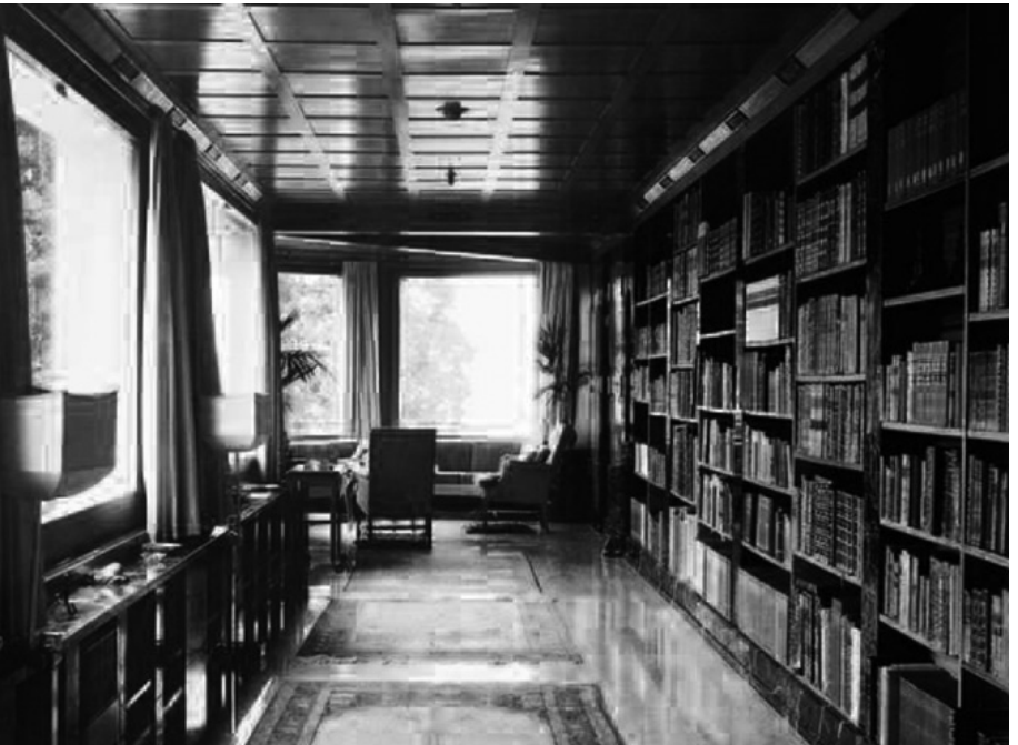
Fig 4 Villa Karma designed by Adolf Loos