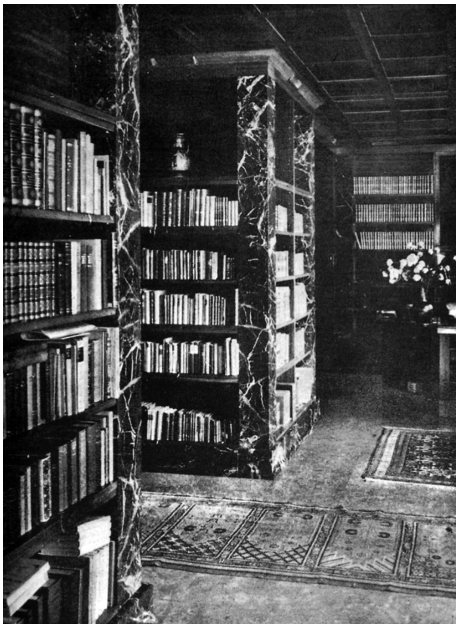
Fig 5 Villa Karma designed by Adolf Loos