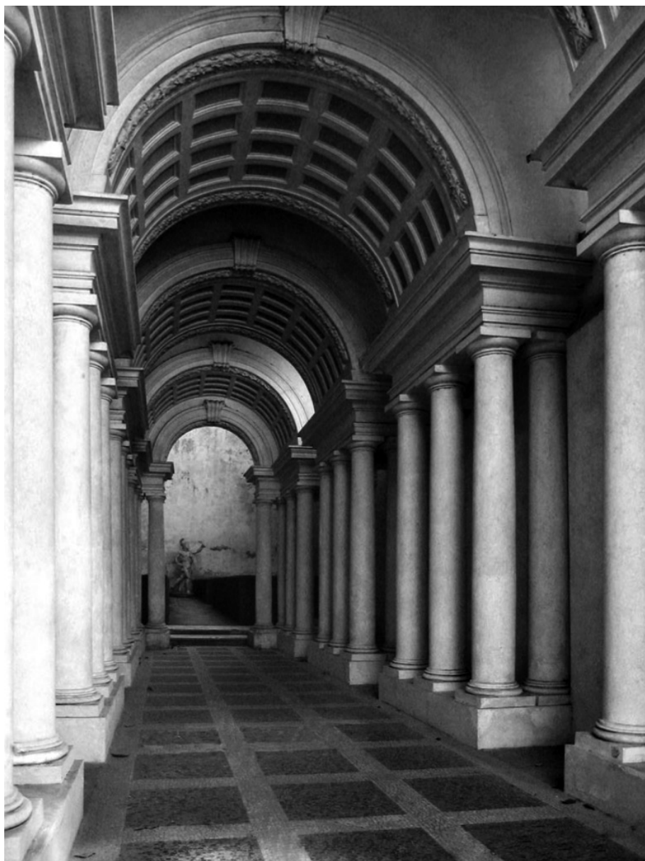
Fig 2 Galleria Spada designed by Francesco Borromini