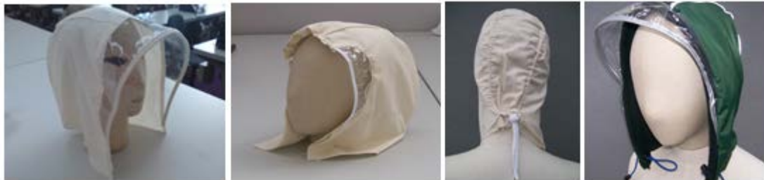
Fig. 2: Case study level 5 (2007-2008)