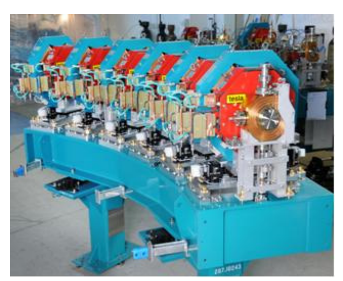
Figure 2: An EMMA girder, with 6 doublet cells mounted. The larger of the magnets is the D and the smaller is the F. RF cavities are mounted in almost every other cell and one can be seen at the end of the girder.

However, to maintain the symmetry of the ring and minimise the effects from resonances, clamp plates are mounted on all the doublets.