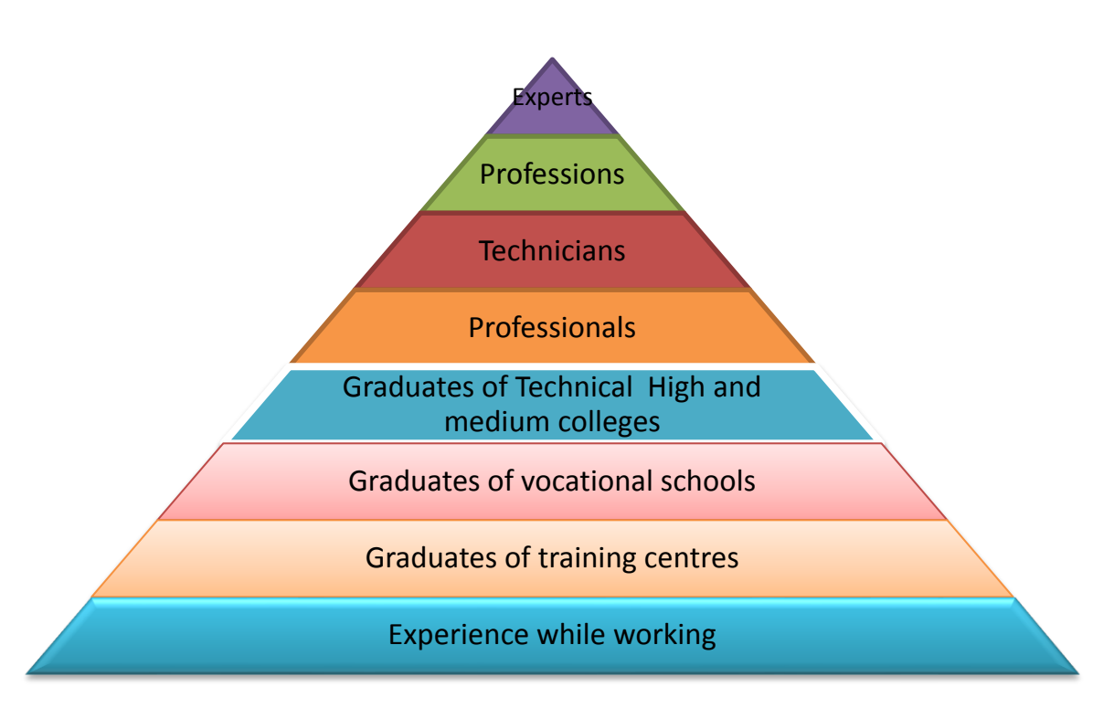
Figure 2: The workforce pyramid in Libya