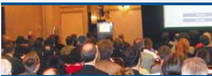
Learn from the Experts

at the New Orleans Marriott on 555 Canal Street, New Orleans, LA