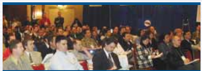
Hear from Visionaries