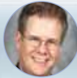
President and CEO, OASIS