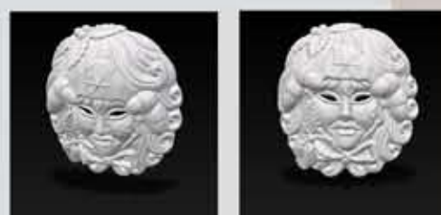
3d3solutions.com sourced August 2011

The software interface offers specific 3D surface design tools which take the user through a sequence of surface processing phases; from organising the scanned physical surface data, to surface preparation and composition of accurate models for 3D design and manufacture.