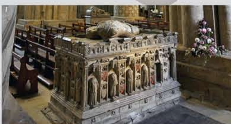
1, Durham Cathedral and Jarrold Printing

Vandalised during periods of religious and civil unrest, the tomb provides an opportunity to re-create and interpret some of the lost sculptural forms carved upon it. In addition, it affords the opportunity to further explore the use of polychromy on mediaeval stone carving.