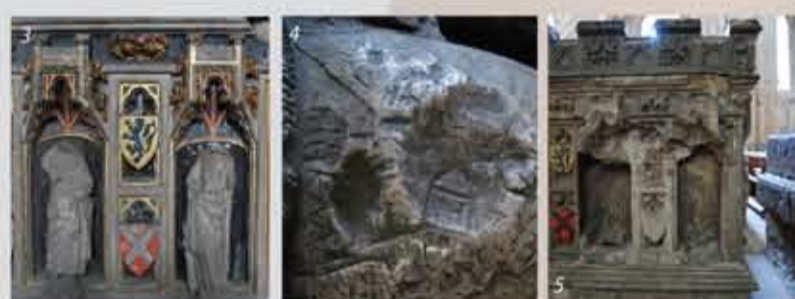
2, 3, 4, 5, Fitzpatrick F August 2011