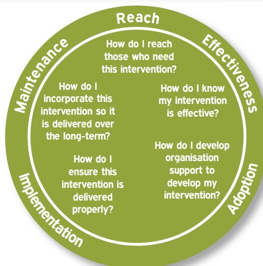
Figure 2: REAIM fig wheel

An example of this was the introduction of peer mentors to an exercise referral scheme. A student from the local