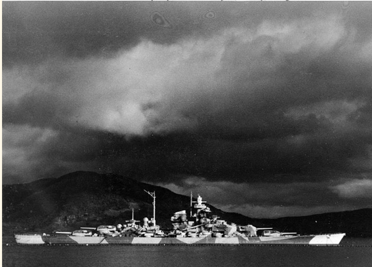
Photo # NH 71390 German battleship Tirpitz in the Alta Fjord, Norway, during World War II