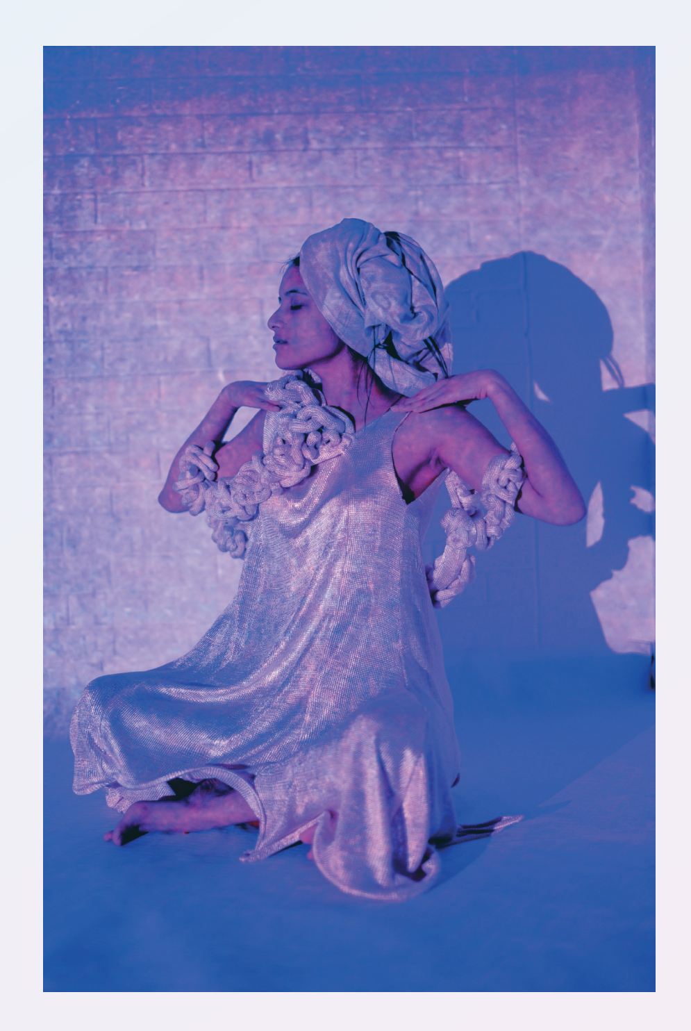
Meditation and Repetition. Impermanence is in a constant state of flux, and a product designer needs to understand this reality to strive for a sustainable future.